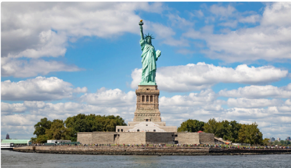
Immigrant Trust Directive