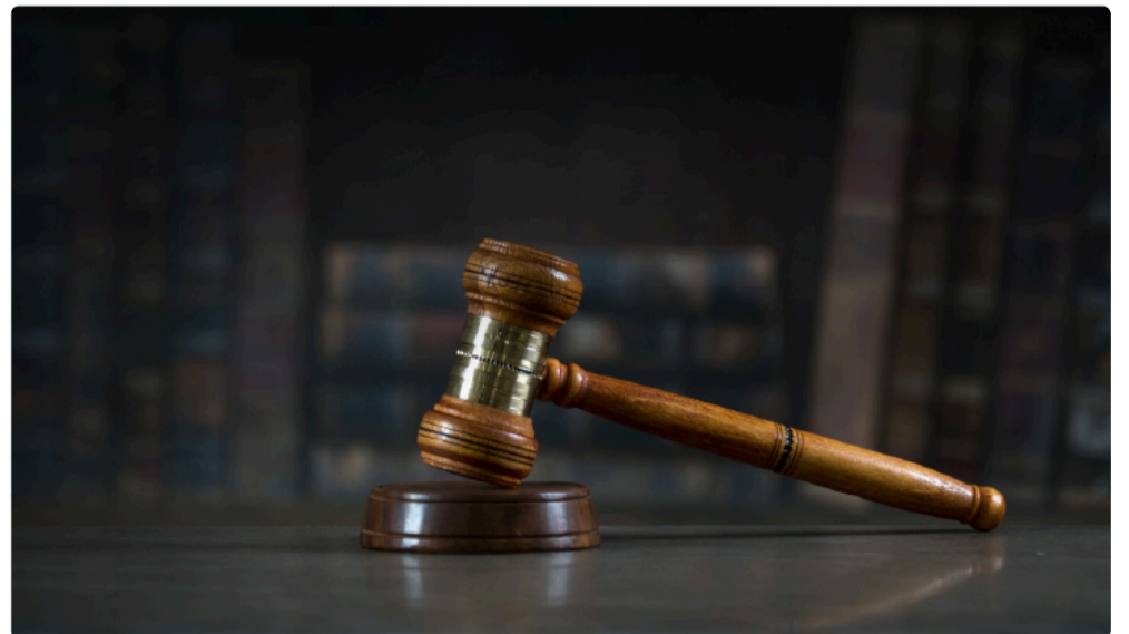
Pro-Bono Legal Services