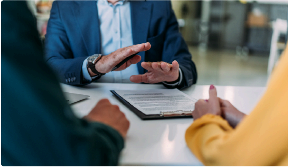
Avoid Immigration Services Fraud