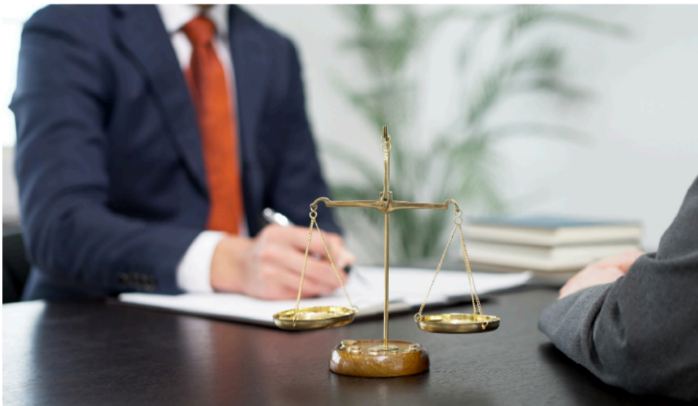
Know Your Rights

Every person who lives in or visits New Jersey has rights regardless of their citizenship or immigration status. You can learn more about your rights and resources below.