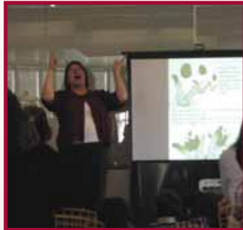
Signing "Open Jaw" to the audience.