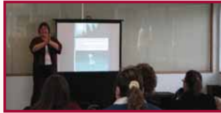
ASL Story Hour at TBBC.