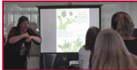
Signing "Rock" to the audience.