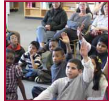
MKSD students ask questions about Guji Guji.