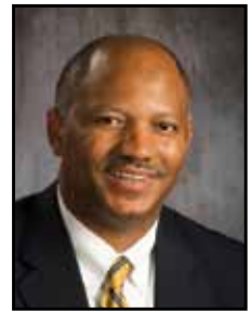
Dwight Jones Commissioner of Education Colorado Department of Education