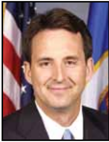
Tim Pawlenty Governor Minnesota