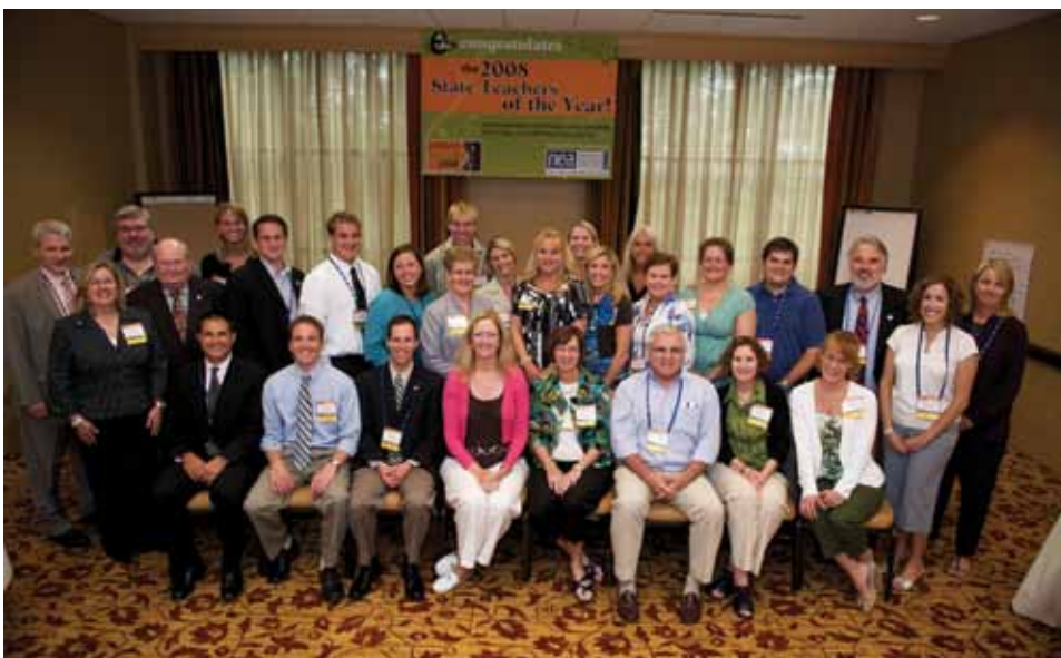
ECS would like to congratulate the 2008 State Teachers of the Year. Many of these extraordinary individuals attended the 2008 National Forum on Education Policy.

The mission of the Teaching Quality and Leadership Institute (TQLI) is to provide state policymakers and education leaders with high-caliber information to advance the quality of teaching and leadership. Subject areas include, but are not limited to: certification and licensure; compensation and diversified pay systems; teacher preparation; recruitment and retention; teacher and principal leadership; and professional development. We accomplish this mission by collaborating with others to explore, create and disseminate new research, model policies and innovative practices that will lead to greater levels of student learning.