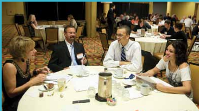
Student leaders and school officials worked to develop action plans during the Education Leadership Colloquium on the Civic Mission of American Education.