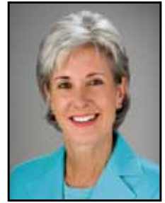
Kathleen Sebelius Governor Kansas