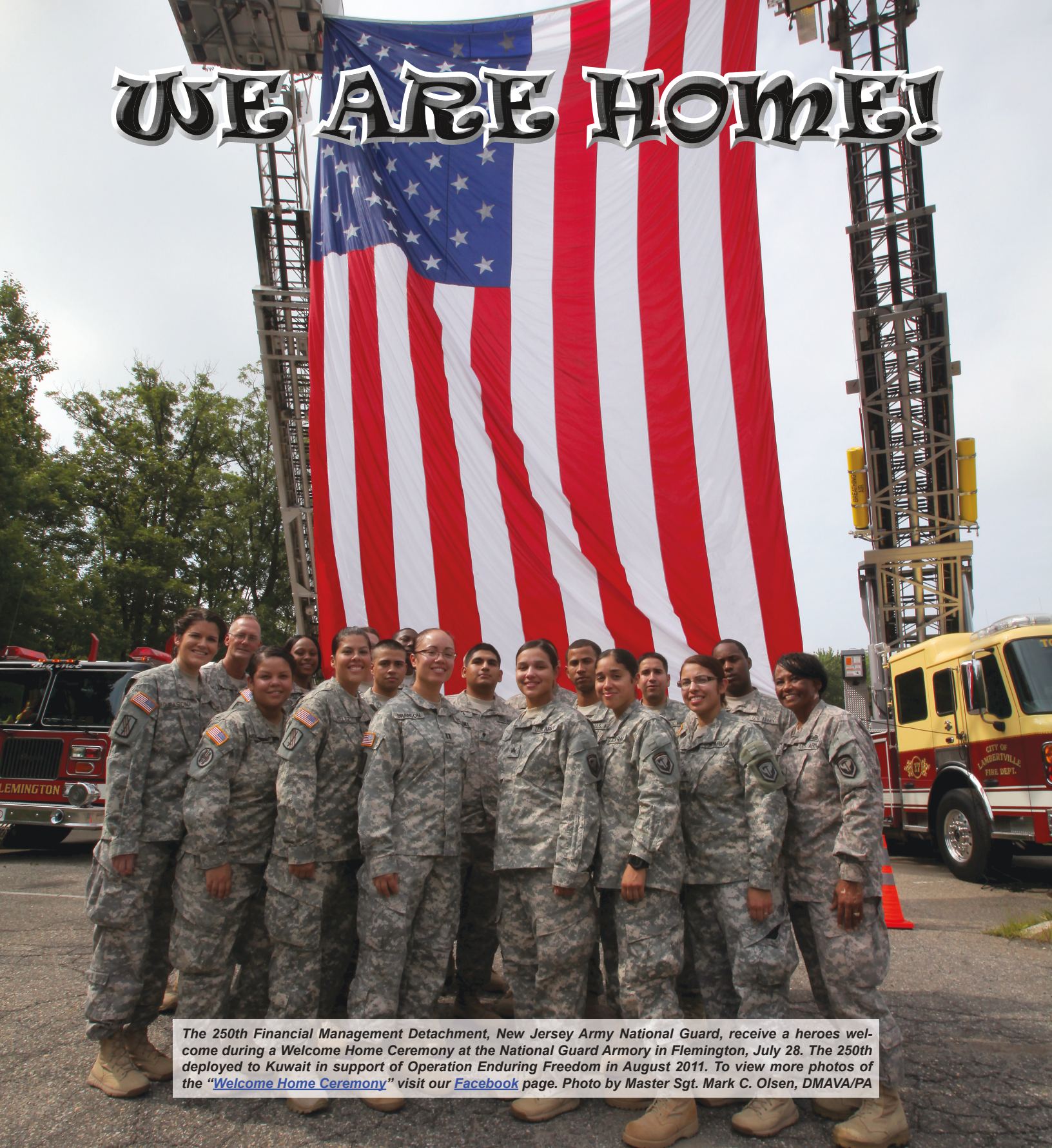
The 250th Financial Management Detachment, New Jersey Army National Guard, receive a heroes welcome during a Welcome Home Ceremony at the National Guard Armory in Flemington, July 28. The 250th deployed to Kuwait in support of Operation Enduring Freedom in August 2011. To view more photos of the "Welcome Home Ceremony" visit our Facebook page.