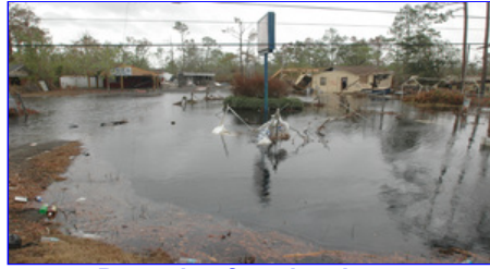
Preparing for a hurricane