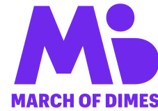
March of Dimes