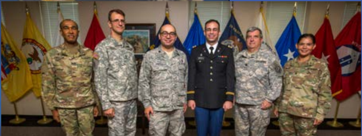
MEMBERS OF THE NEW JERSEY NATIONAL GUARD CHAPLAIN CORPS POSE FOR A PHOTO AT THE NEW JERSEY DEPARTMENT OF MILITARY AND VETERANS AFFAIRS, LAWRENCEVILLE, N.J., SEPT. 8, 2016.