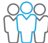
Community Assessment and Health Education