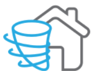
Health Preparedness and Planning