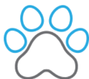
Animal Shelters and Adoptions