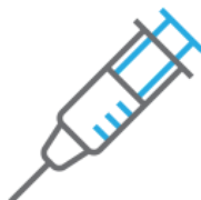
Infectious Disease Services