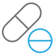
Alcohol and Drug Services