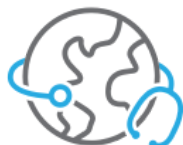
Environmental Health Services