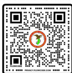
YOUR VETERANS BENEFITS

If you are reading this publication online, you can click on any of the images or URLs to go to the link. Follow us on: