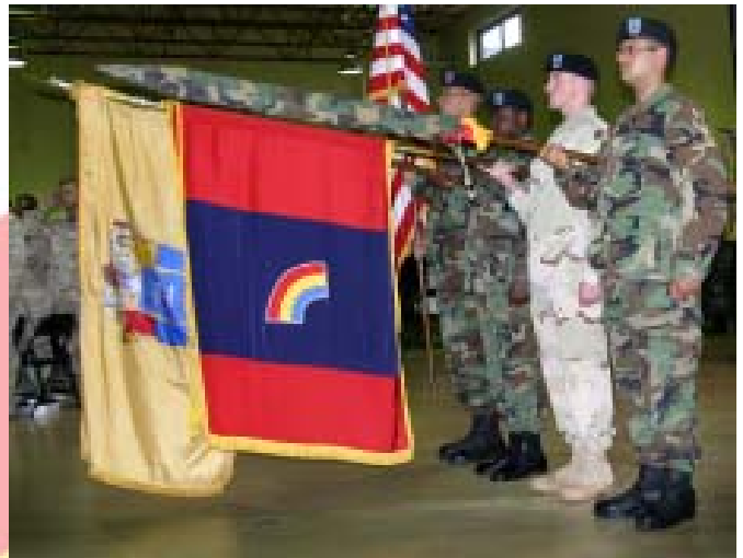
The 42 nd DISCOM colors on display for the last time.