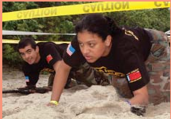
Cadets perform the low crawl while tackling the obstacle course on the dunes of Sea Girt.

New Brunswick High School received top honors, but every school walked away with at least one trophy.