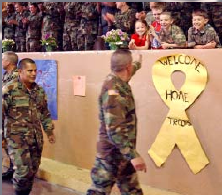
Family members at the Morristown Armory wave as Soldiers from A Battery, 3-112 th Field Artillery file past June 4.