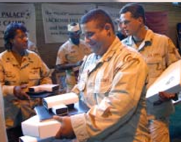
...n (MSB) observe the ceremony welcoming them home ...om Salute packages following their ceremony. Photos