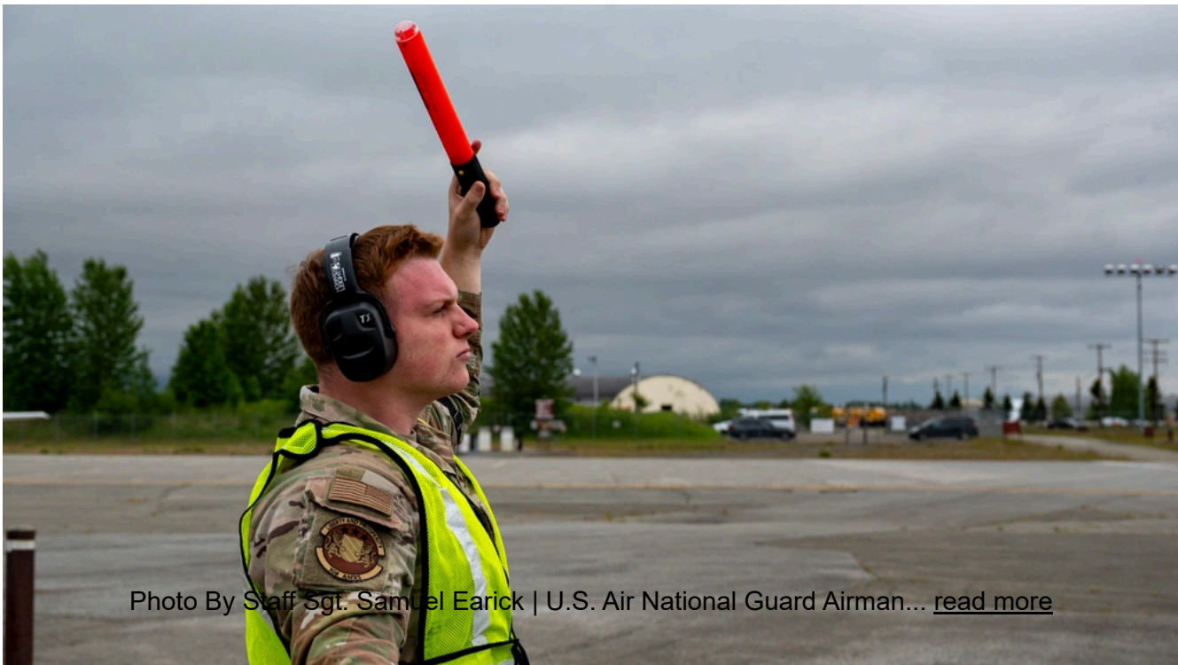
U.S. Air National Guard Airman... read more

JOINT BASE ELMENDORF-RICHARDSON, ALASKA, UNITED STATES