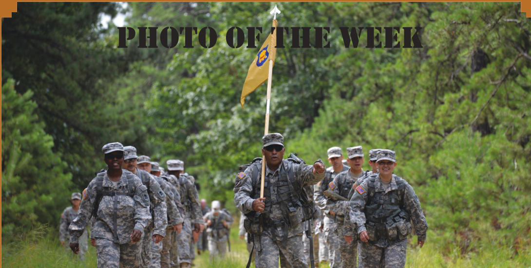
PHOTO OF THE WEEK

Nearly two dozen Soldiers from Joint Force Headquarters participated in a six-mile foot march at Joint Base McGuire-Dix-Lakehurst July 21, which began with an air movement aboard UH-60 Black Hawk Helicopters. The New Jersey National Guard Soldiers carried a minimum load of 25 pounds during the foot march, formerly known a ruck marches. The foot marches are a key component of the Army's revamped fitness program, Physical Readiness Training, which focuses on strength, speed and endurance. Photo by Spc. Bob Neill, 444th MPAD