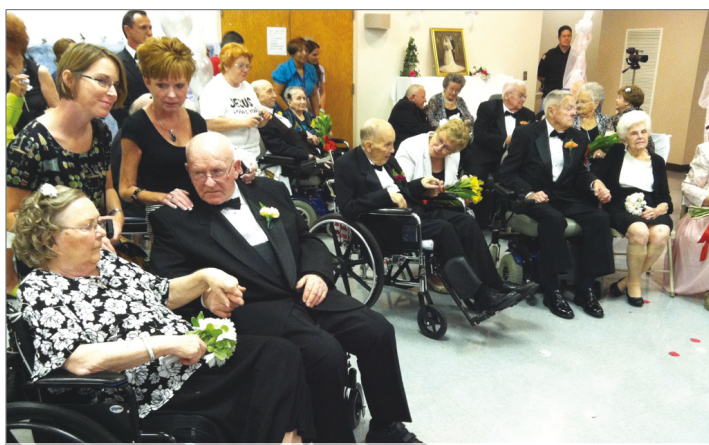
Eighteen couples at the New Jersey Veterans Memorial Home at Vineland renew their wedding vows July 26, at the Veterans Home's auditorium.