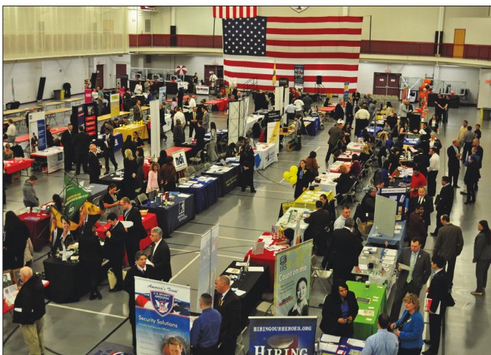
More than 110 veterans looking for jobs got the opportunity to meet with employers at the Hiring Our Heroes job fair held at Rider University March 21, 2013. The Rider student recreation center floor in Lawrenceville was filled with more than 70 employers and 19 veteran service organizations. Veterans can use the Hero To Hire website https://h2h.jobs/ to start a job search.

With an annual allocation from DMHAS of $850,000, CCGNJ works with 35 agencies statewide to provide education and treatment to problem gamblers and maintains a 24-hour confidential hotline, 1-800-GAMBLER and the website http://www.800gambler.org that lists additional resources.