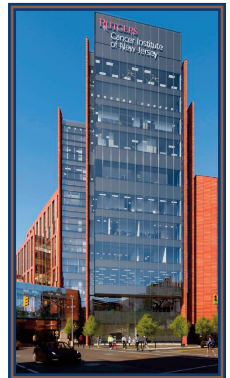
Rendering of the future Rutgers Cancer Institute of New Jersey

The New Jersey researchers made a total of 16 presentations highlighting their data on leukemia, lymphoma, melanoma and breast, lung and kidney cancer. Most significant, however was the new examinations of the impact of racial disparities on cancer risk, survival and care.