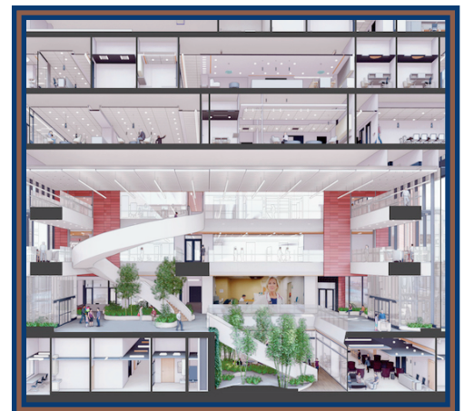
Rendering of the future Rutgers Cancer Institute of New Jersey atrium.