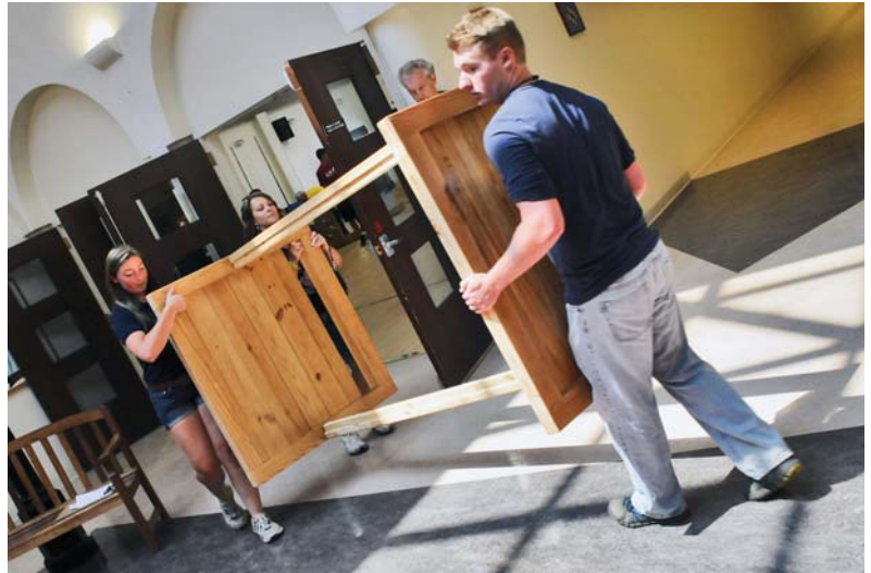
Volunteers from the New Jersey American Legion and Phillipsburg High School students from the Staterliners football and soccer teams, the Key Club and the Future Farmers of America, unload, assemble and arrange furniture at Veterans Haven North in Glen Gardner, N.J. on July 30, 2014. The New Jersey American Legion purchased $167,000 worth of wooden beds, dressers, desk, chairs and nightstands for the residents.