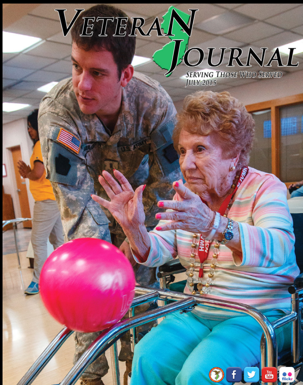
New Veteran Journal Clicking on the picture will take you to a PDF of the magazine. Printed copies will be available soon!