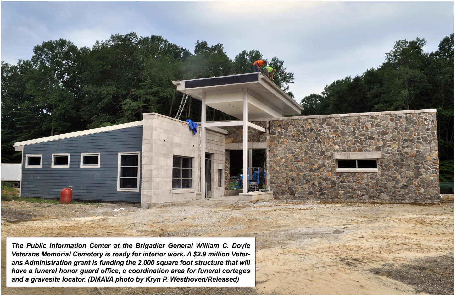
The Public Information Center at the Brigadier General William C. Doyle Veterans Memorial Cemetery is ready for interior work. A $2.9 million Veterans Administration grant is funding the 2,000 square foot structure that will have a funeral honor guard office, a coordination area for funeral corteges and a gravesite locator.