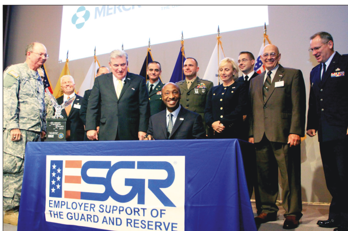
Surrounded by New Jersey Lt. Gov. Kim Guadagno, center, and national and state representatives from the Employer Support of the Guard and Reserve, Merck & Co., chief executive officer, Kenneth C. Frazier, seated, signs the ESGR's Statement of Support at the company's headquarter in Whitehouse, N.J., on Sept. 29. The Statement of Support states that an employer will continue to recognize and support the nation's military service members and their families in peace time, in crisis and in war. The ESGR Statement of Support Program seeks to inform and educate employers about their rights and responsibilities towards their employees who serve in the National Guard and Reserve, and to also recognize and reward those employers who go "over and above" the requirements of the law.