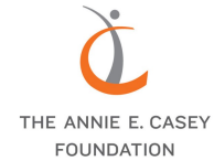
Annie E. Casey Foundation