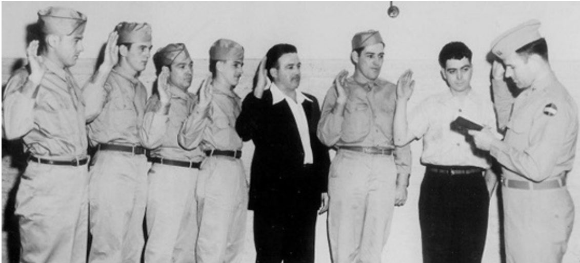
The seven Weeks brothers.