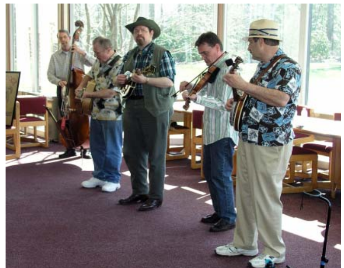
The Bad Dogz were among the live bands who provided musical entertainment during the 21st annual Pinelands Short Course.

The Pinelands Short Course is sponsored by the Commission, the Pinelands Institute for Environmental Studies (or P.I.N.E.S.) and Burlington County College, which has hosted the event at its Pemberton Township campus since 2004. The event is registered with the New Jersey Department of Education, and professional development credits are available to New Jersey teachers who attend.