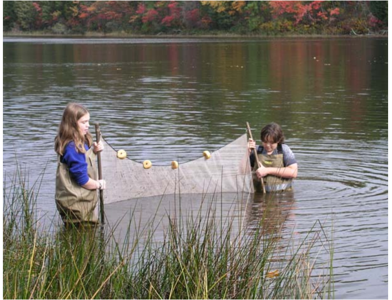
More than 180 students and teachers participated in the Commission's annual World Water Monitoring Day Event. Students above use a net to survey for native Pinelands fish.