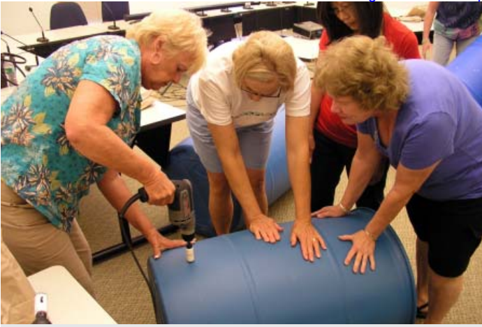
Participants learned how to make rain barrels during presentation sponsored by the Pinelands Commission in 2010.

it to support uniquely adapted Pinelands plants and animals. The students' findings were posted on the World Water Monitoring Day Web site ( www.worldwatermonitoringday.org ), where test results can be compared over time. In addition to assisting with the water tests, staff from the Pinelands Commission used nets to catch native Pinelands fish and demonstrated how the Commission protects wetlands and habitat for rare plants and animals.