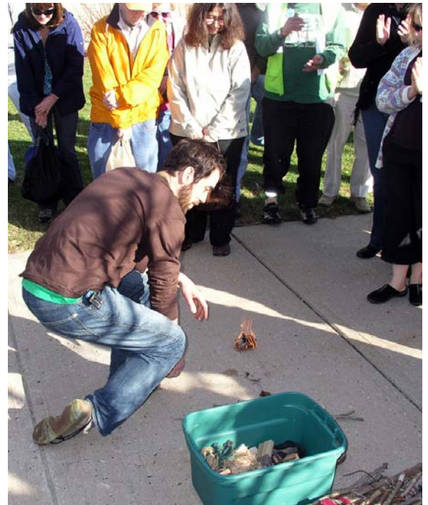
Participants learned how to make fire during a Pinelands Survival course offered during the 21st annual Pinelands Short Course. The event drew a record crowd of more than 800 people.