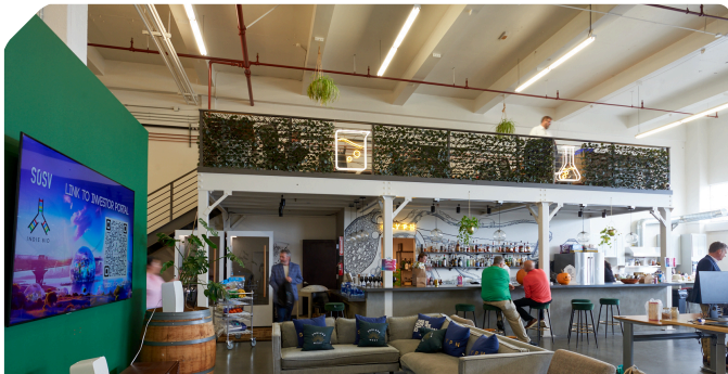
IndieBio SF office