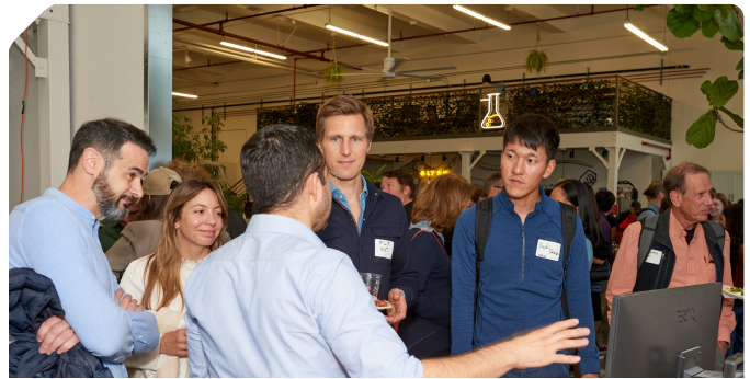
IndieBio SF demo day

The friendships founders build in the HAX and IndieBio programs last forever, and so do their ties to our general partners, who long remain trusted advisors. We continue helping founders raise funds, make connections, and win press coverage long after they finish our programs. We also produce unique, high profile events to showcase our founders as well as drive the overall climate and health ecosystem, including the SOSV Climate Tech Summit , the SOSV VC-Founder Matchups ( Sustainable Industry , Health , and Climate ), and our SOSV Climate 100 and Health 100 lists. SOSV is for life.