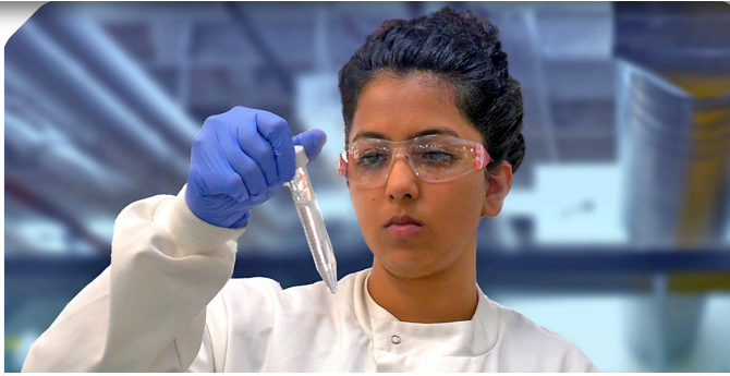
IndieBio SF lab