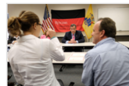
Friday, April 22, 2016 IME Call Center