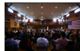
School Funding Formula Town Hall - Tuesday, October 4, 2016 Wayne