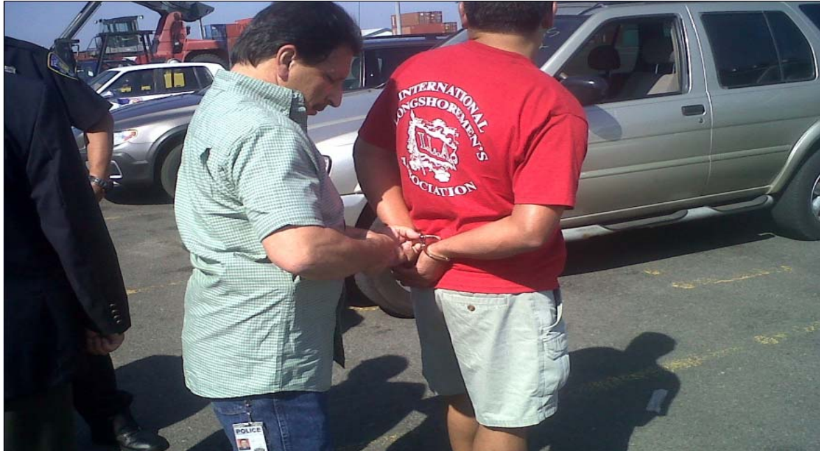
Waterfront Commission Detectives Making a Pier Side Arrest

The Division continues to follow the Compstat model for case review, and conducts weekly Supervisors' meetings with both the Executive Director and the General Counsel. The Police Division, working in conjunction with the Law, Intelligence and Administration Divisions, had 55 open investigations pending as of July 1, 2010 and had completed 338 investigations during FY 2010 including 5 involving unregistered workers, and 89 involving violations of Waterfront Commission rules. The Division made, or participated in, 66 arrests in FY 2010.