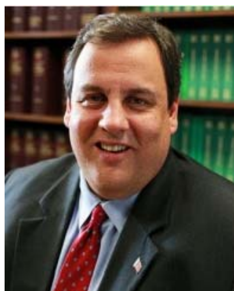
To the Honorable Chris Christie, Governor and the Legislature of the State of New Jersey

The vestiges of the former Commission, rightfully criticized by the New York State Inspector General more than a year ago, have been banished, and under the auspices of our new administration, the Commission has undergone a complete transformation. It has evolved from a virtually moribund organization into a vibrant, model regulatory and law enforcement agency committed to fulfilling its statutory mandate. The Commission is striving to effectuate dramatic changes in the culture of a troubled industry, which has been historically and is currently plagued by organized crime and corruption. In the past two years, the new leadership of the Commission has rededicated itself to its core missions – to investigate, deter, combat and remedy criminal activity and influence in the Port of New York-New Jersey, and to ensure fair hiring and employment practices.