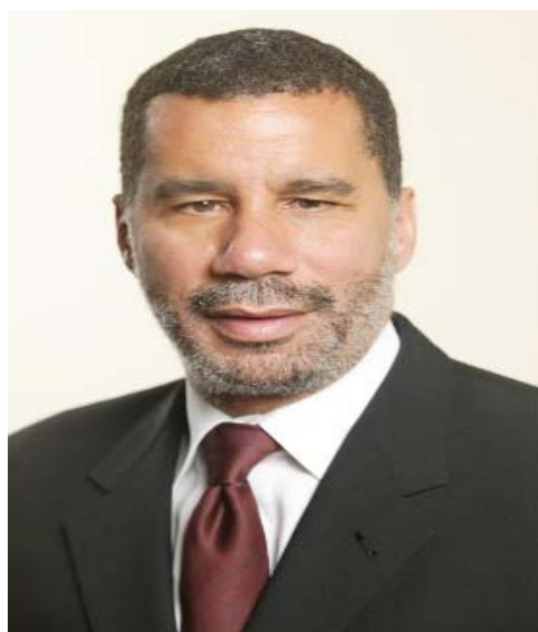
To the Honorable David Paterson, Governor and the Legislature of the State of New York