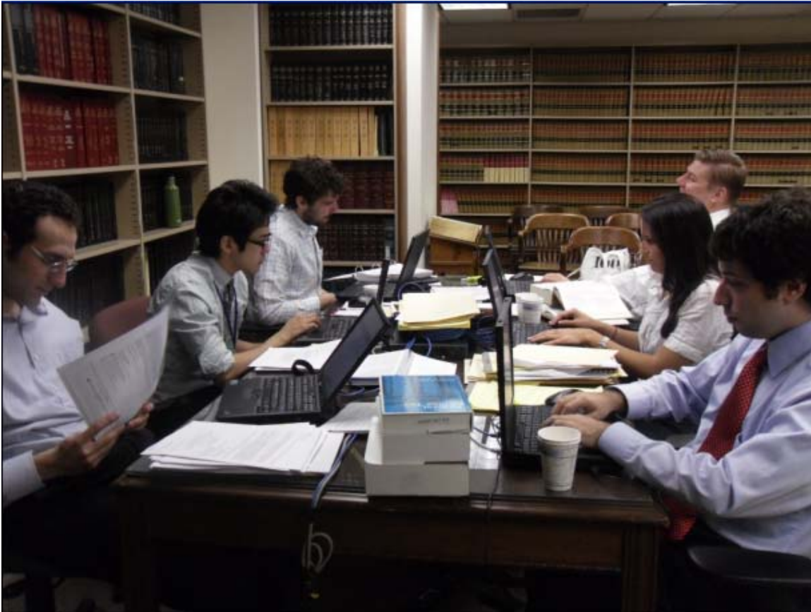
The 2010 Summer Legal Interns

The Law Division's Summer Internship Program was comprised of six law school students this past summer. The Commission has entered into an agreement with area law schools to administer a clinical program for third-year law students. The students will work at the Commission on a part time basis in return for credit.