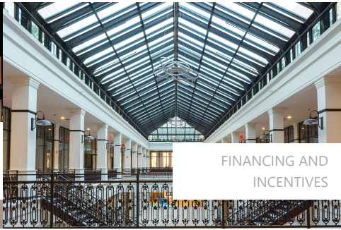
FINANCING AND INCENTIVES