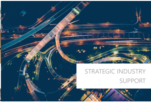
STRATEGIC INDUSTRY SUPPORT