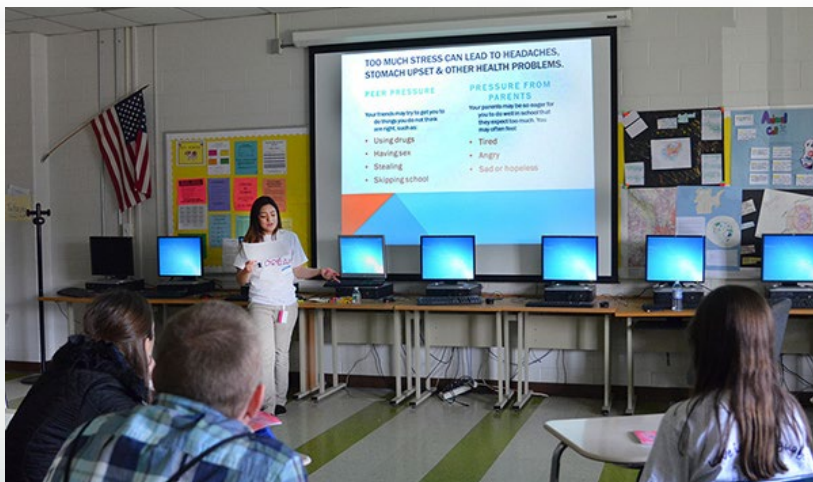
(Top two pictures) PCTI students leading Break-Out Sessions