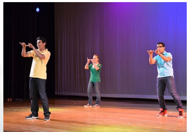
ASL III students performing: "Keep Your Head Up"