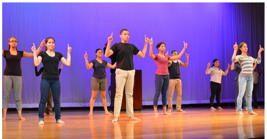
Students performing dance piece: “Deaf President Now”

The moving and informative breakout sessions given by senior P.C.T.I. students provided insight into dealing with life challenges,