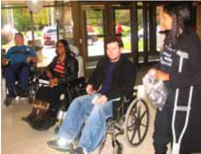
Monday Morning advocates on an accessibility tour in Somerset County.

The role of individuals with developmental and other disabilities are self-advocates within the political process as a critical element of any overall approach to attaining integration, independence and productivity.