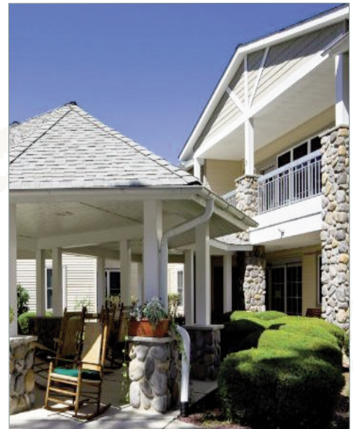
House of the Good Shepherd

The proceeds of the Series 2012 Bonds, together with other funds, were used to provide funds to refund and redeem all of the Authority’s outstanding Health Care Facilities Revenue Bonds Series 2001, and to pay the related costs of issuance. The transaction enabled House of the Good Shepherd to attain a present value savings of 25.63%, or $4,087,504, of the refunded bonds.