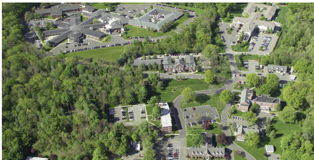
Christian Health Care Center

On April 24, 2013, the Authority signed a purchase contract with Wells Fargo Securities for the sale of $29,525,000 of bonds on behalf of the Meridian Health System. Meridian locked in a True Interest