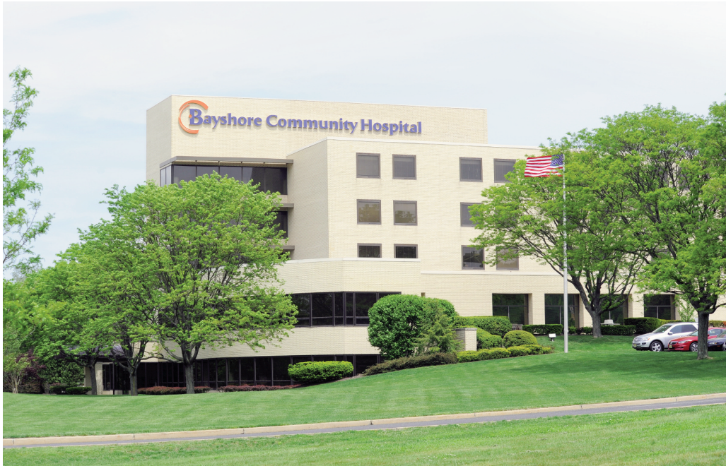
Bayshore Community Hospital - Meridian Health

The proceeds of the bonds, together with other funds, were used to currently refund and redeem the Authority’s outstanding St. Luke’s Warren Hospital Issue, Series 2012 Revenue Bonds, which were privately placed with Allstate Insurance, and to pay the related costs of issuance. St. Luke’s Warren achieved net present value savings over $17 million (or 40%) and the all-in True Interest Cost was 4.31%. §