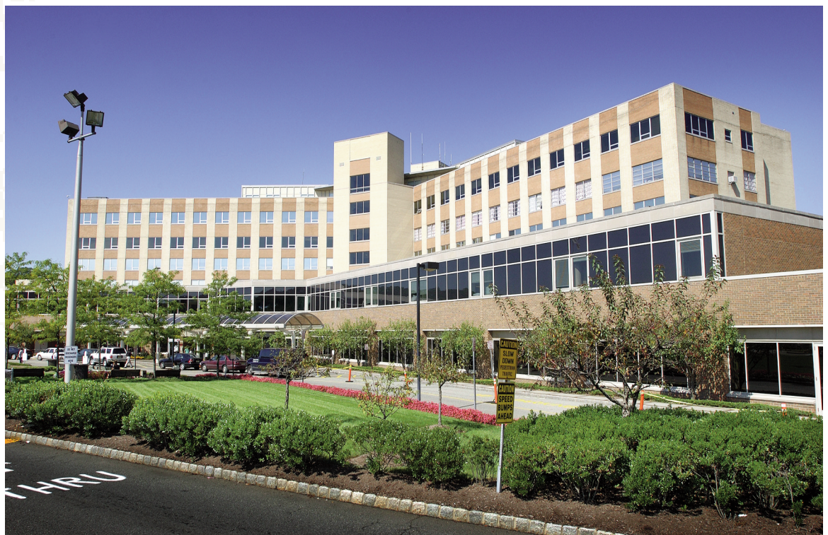
Saint Barnabas Medical Center