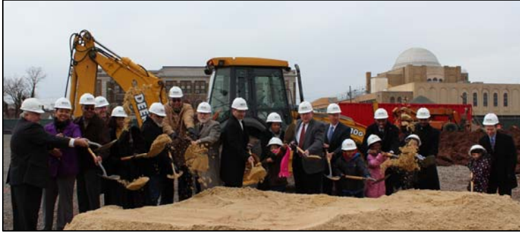
Groundbreaking for new A. Chester Redshaw E.S. in New Brunswick

March 21, 2013 was a day that was anxiously awaited by the members of the New Brunswick community who braved the cold weather to participate in the groundbreaking for the District's new A. Chester Redshaw Elementary School. As the first design-build project to advance under the Christie