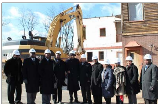
Officials Tour Phase 1 Activities at PS 16 Site

Also that month, SDA and Paterson Public Schools officials joined local legislators and city officials to tour the Phase 1 activities at the new PS 16 construction site. This work includes demolition of 26 commercial/residential buildings on the three acre site, removal of any hazardous material, removal of underground and above ground storage tanks, site demolition and controlled backfill to prepare the site for future construction.