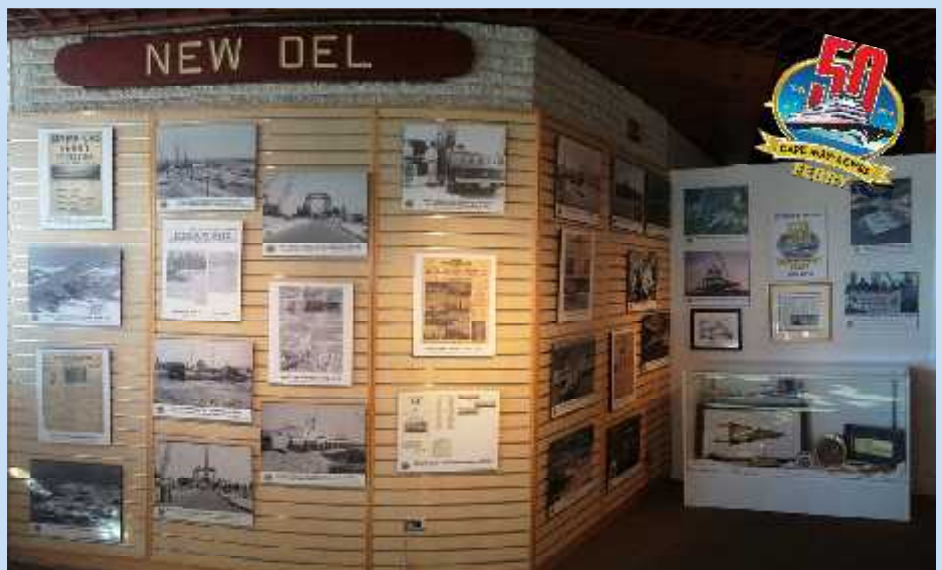
Lewes, DE— This display inside the gift shop at the Cape May-Lewes Ferry Terminal here shows photos and other memorabilia of the Ferry service's early days. ■