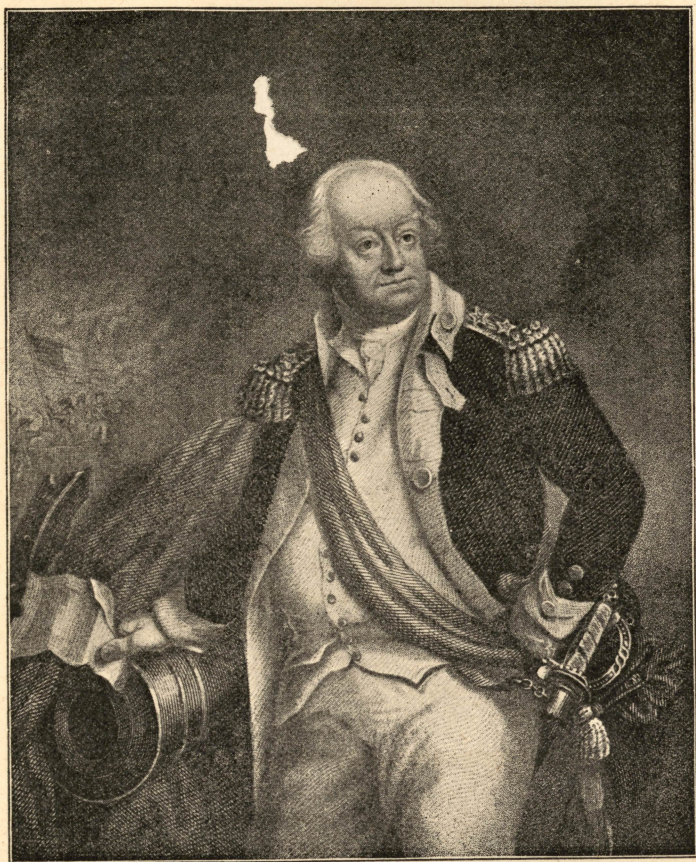
MAJOR GENERAL BENJAMIN LINCOLN,