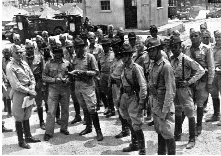
102nd Cavalry Officers at Fort Jackson in 1941.