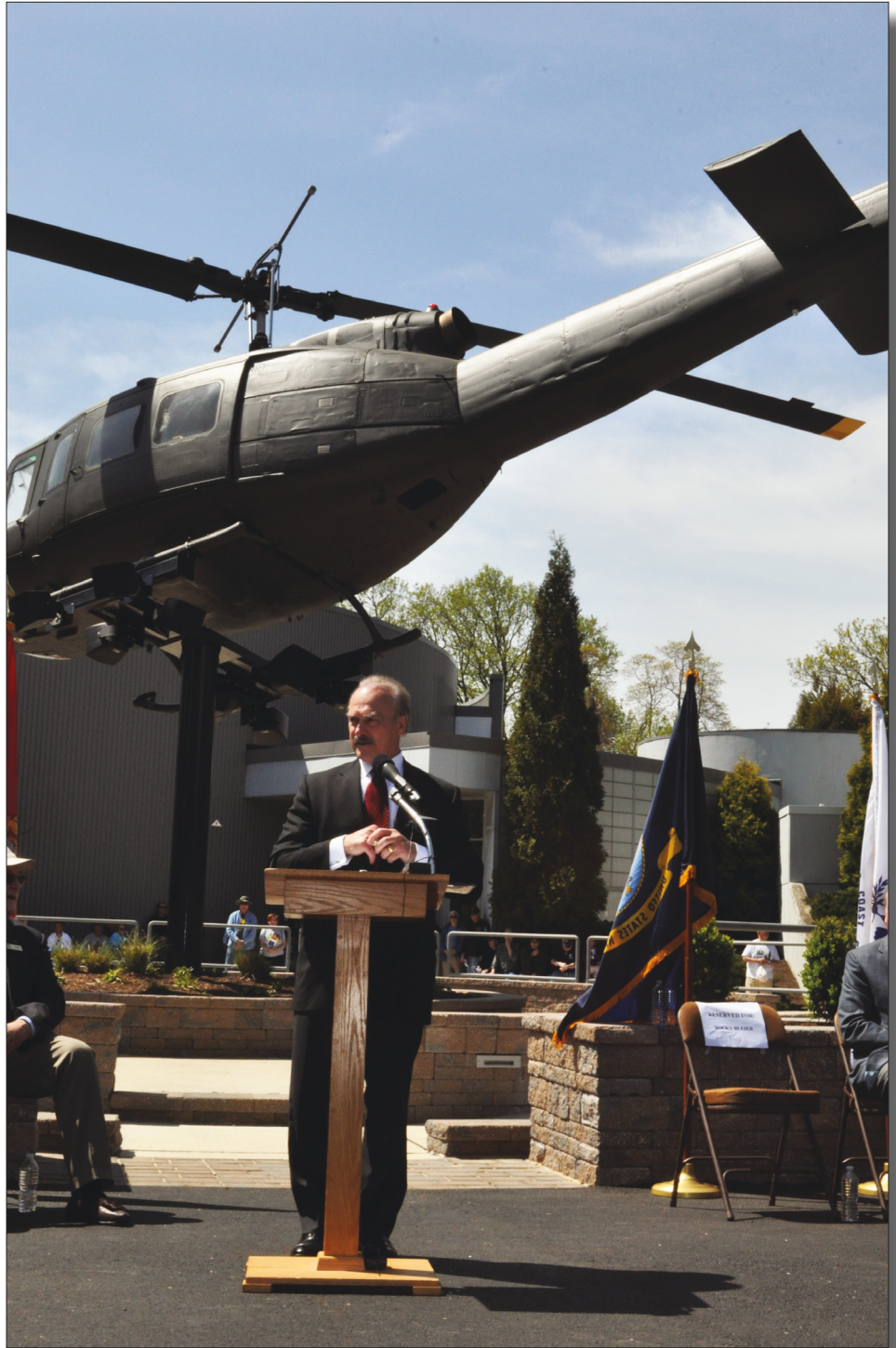
Former Pittsburgh Steelers running back Rocky Bleier, who became a four-time Super Bowl champion after a long rehabilitation from wounds sustained as an infantryman in Vietnam, was the keynote speaker at New Jersey Vietnam Veterans Remembrance Day.

“It may be a little late but this is our way of saying thank you,” she added. “Thank you for your service and welcome home.”