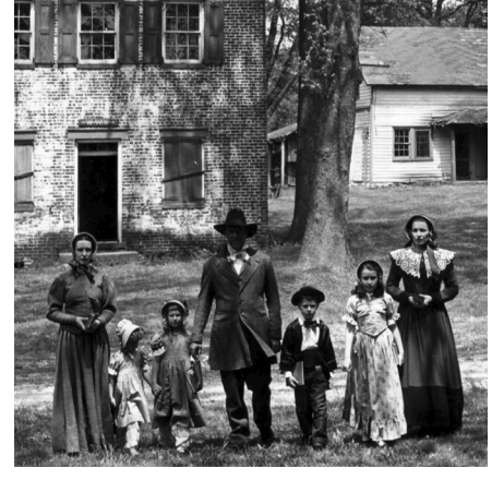
Costumed interpreters at Allaire Village.

By 1967 there were several historic sites in New Jersey's park system, including such large complexes as Allaire Village, Batsto, and Ringwood Manor. These were managed by the very