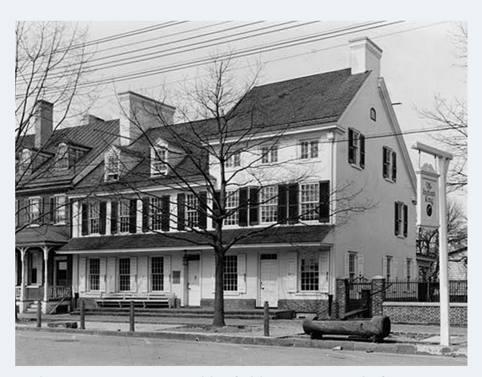
Indian King Tavern, Haddonfield. New Jersey's first stateowned historic site.

here is widespread agreement that the signing of the National Historic Preservation Act in 1966 was a major, "watershed" event in the modern era of historic preservation in the United States, but few people remember that New Jersey played a leading role in its passage or recall the history of preservation in New Jersey prior to it. The State of New Jersey had first placed its toe in historic preservation waters in 1874, when it incorporated the Washington Association of New Jersey and gave the organization an annual stipend to help maintain the Ford Mansion in Morristown as a museum. In 1903, the State took another important step when it bought the Indian King Tavern in Haddonfield as its first stateowned historic property. Every few years thereafter, for the next three decades, the State added another historic property to its collection. Historical societies, the Daughters of the