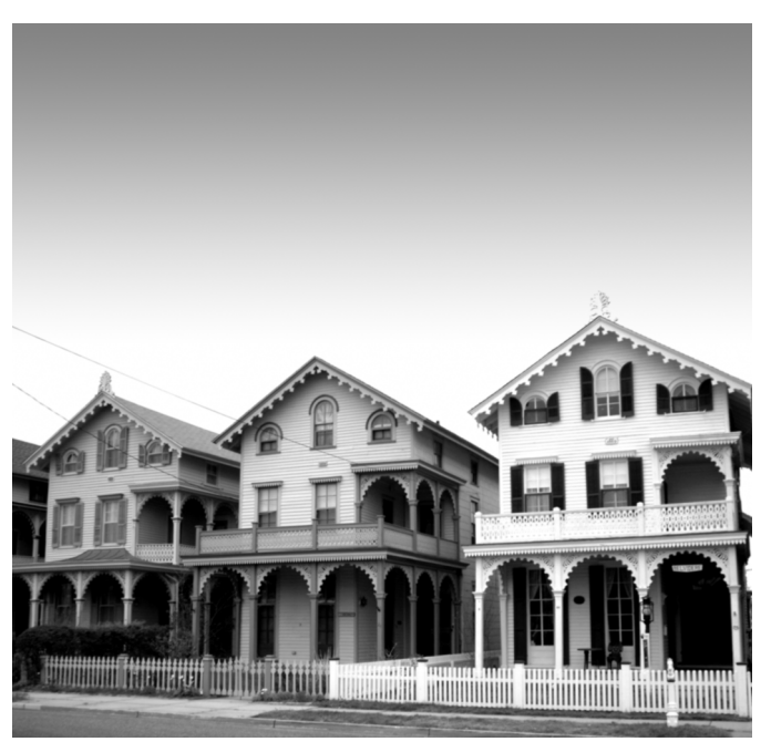
Cape May Historic District.

send the nomination to the National Register. The SHPO's signature would also place the property on the State Register.* The National Trust for Historic Preservation hailed it in "Preservation News" as the first time a state had provided protection for listed sites similar to the Federal program's Section 106. However, only sites that already were listed could be considered. This was remedied to some extent by Governor William Cahill's Executive Order 53, which called for the consideration of eligibility when major construction costs were