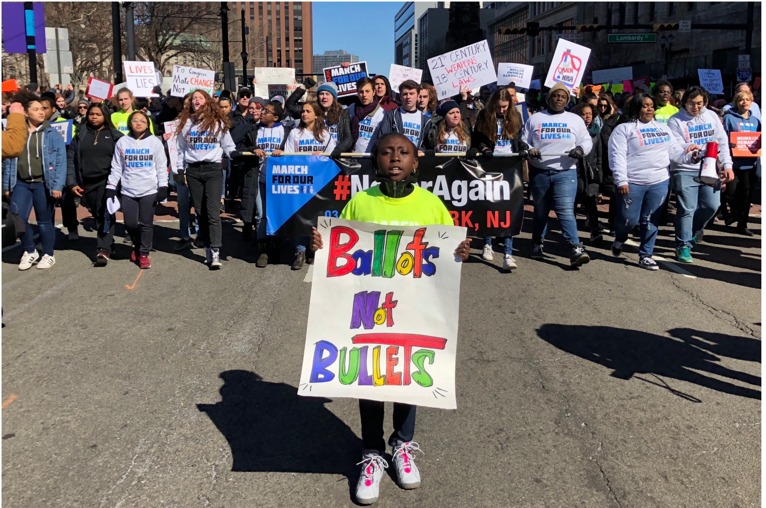
A little girl stands with students in the March for our Lives March in Newark on Saturday, March 24, 2018.