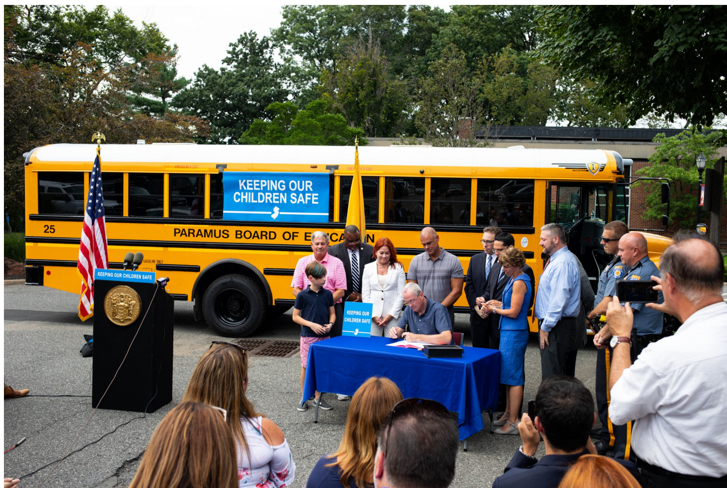
Governor Phil Murphy signs legislation requiring certain school buses to be equipped with lap and shoulder seat belts on Saturday, August 26, 2018.