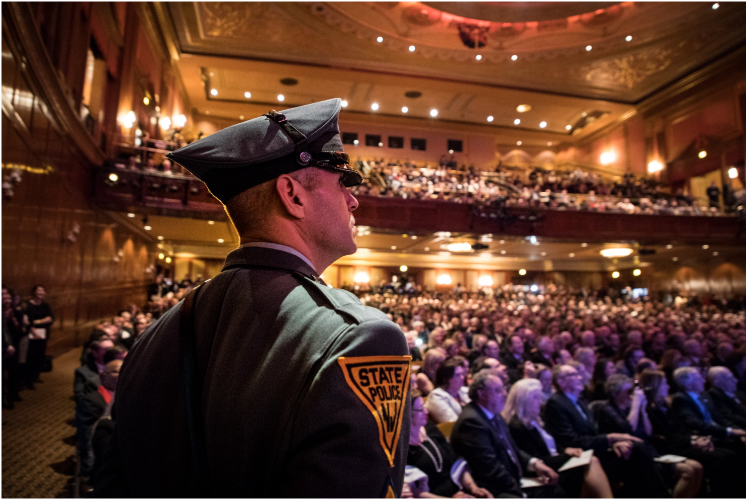
A state trooper watches over the audience during the Governor's inauguration at War Memorial in Trenton on Tuesday, January, 16, 2018.