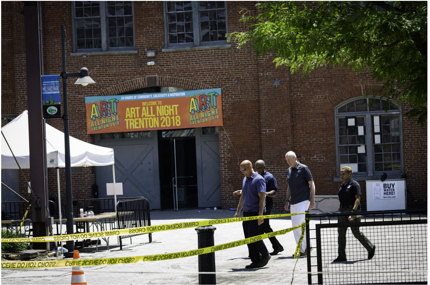
Governor Phil Murphy responds to the aftermath of a shooting at the Trenton Art All Night festival on Sunday, June 17, 2018.