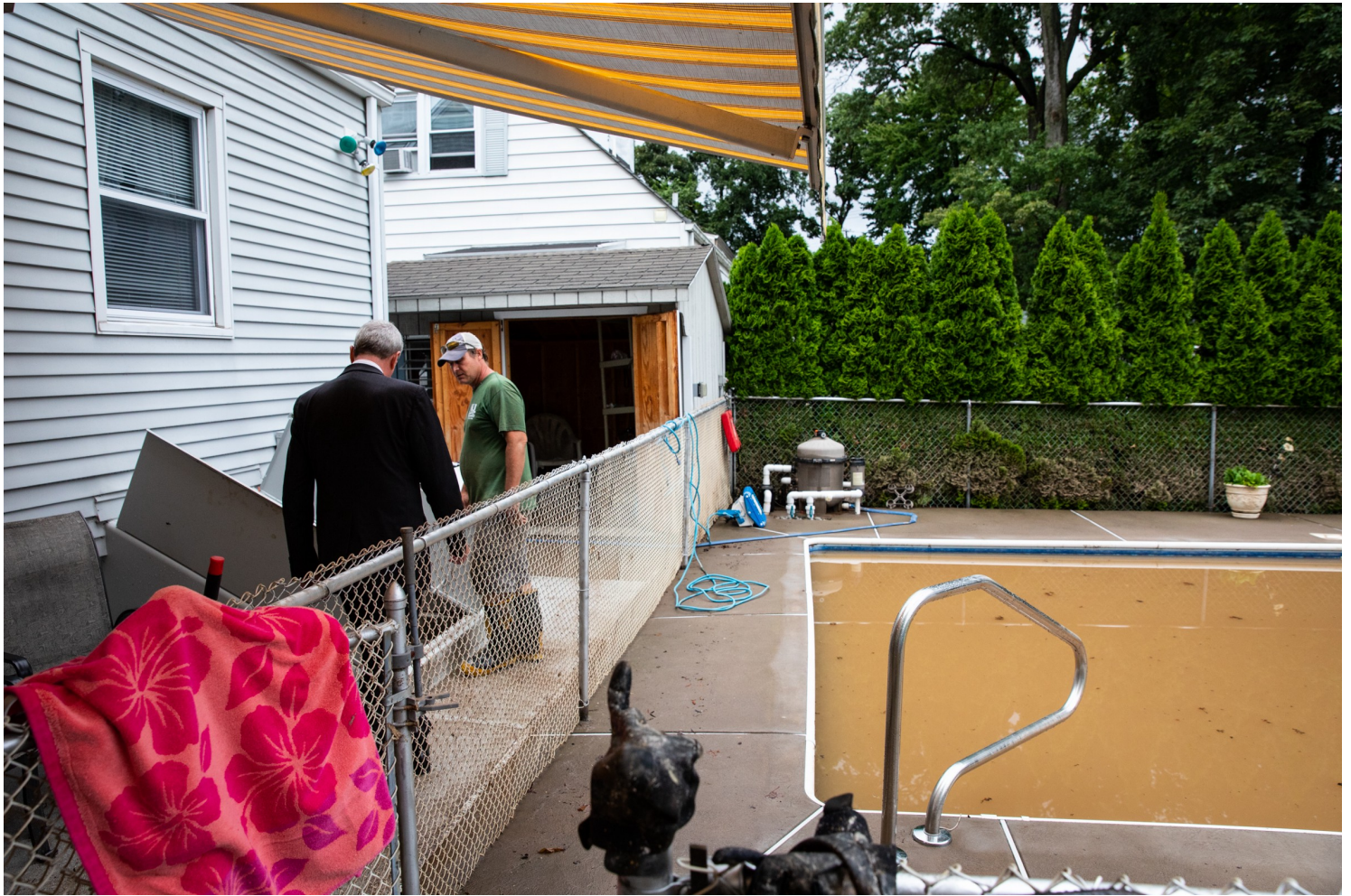
Governor Phil Murphy tours damaged homes in Little Falls after a storm on Monday, August 13, 2018.