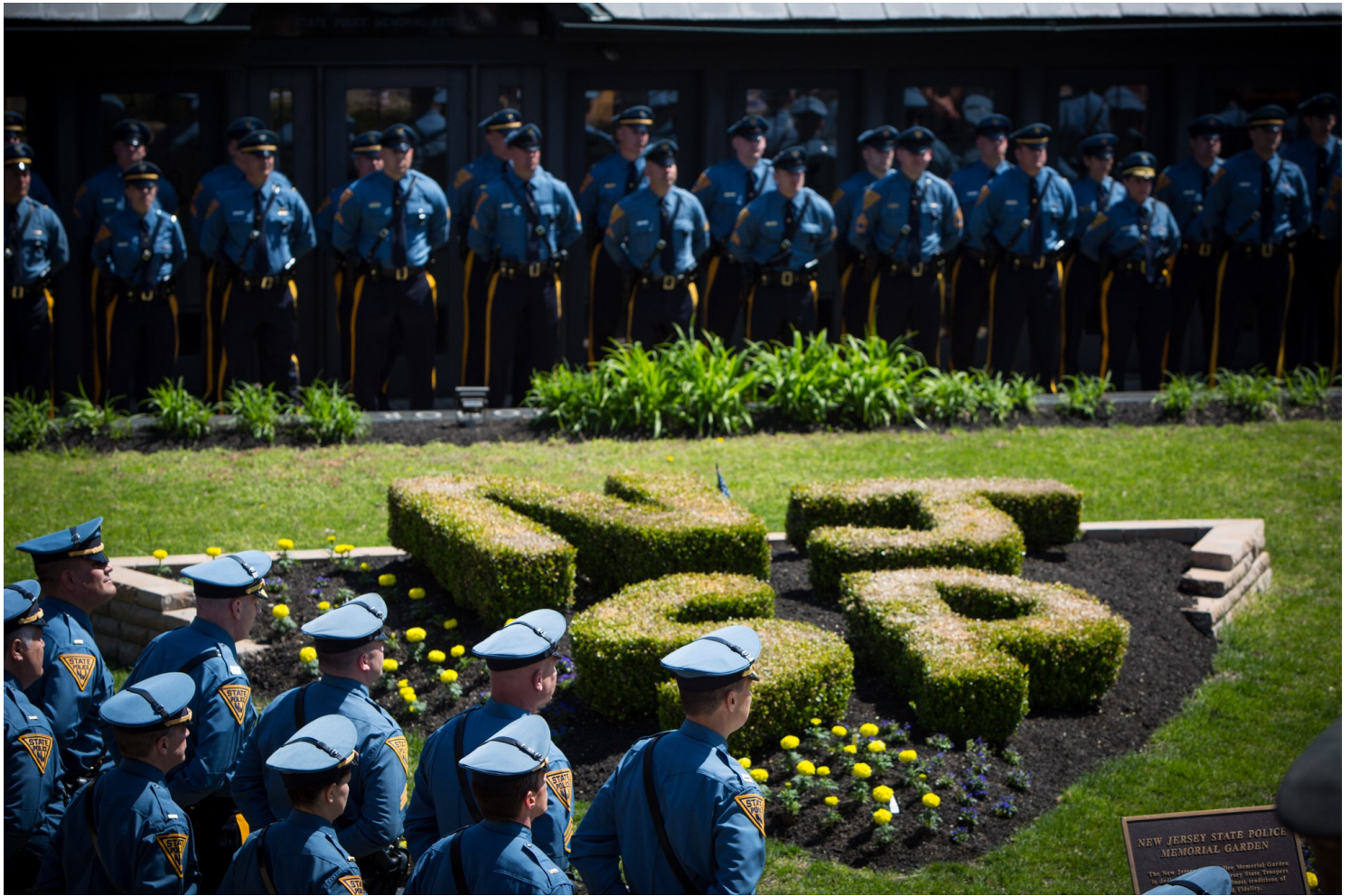
New Jersey State Police at the annual Survivors of the Triangle Memorial Service in Trenton on Tuesday, May 1st, 2018.