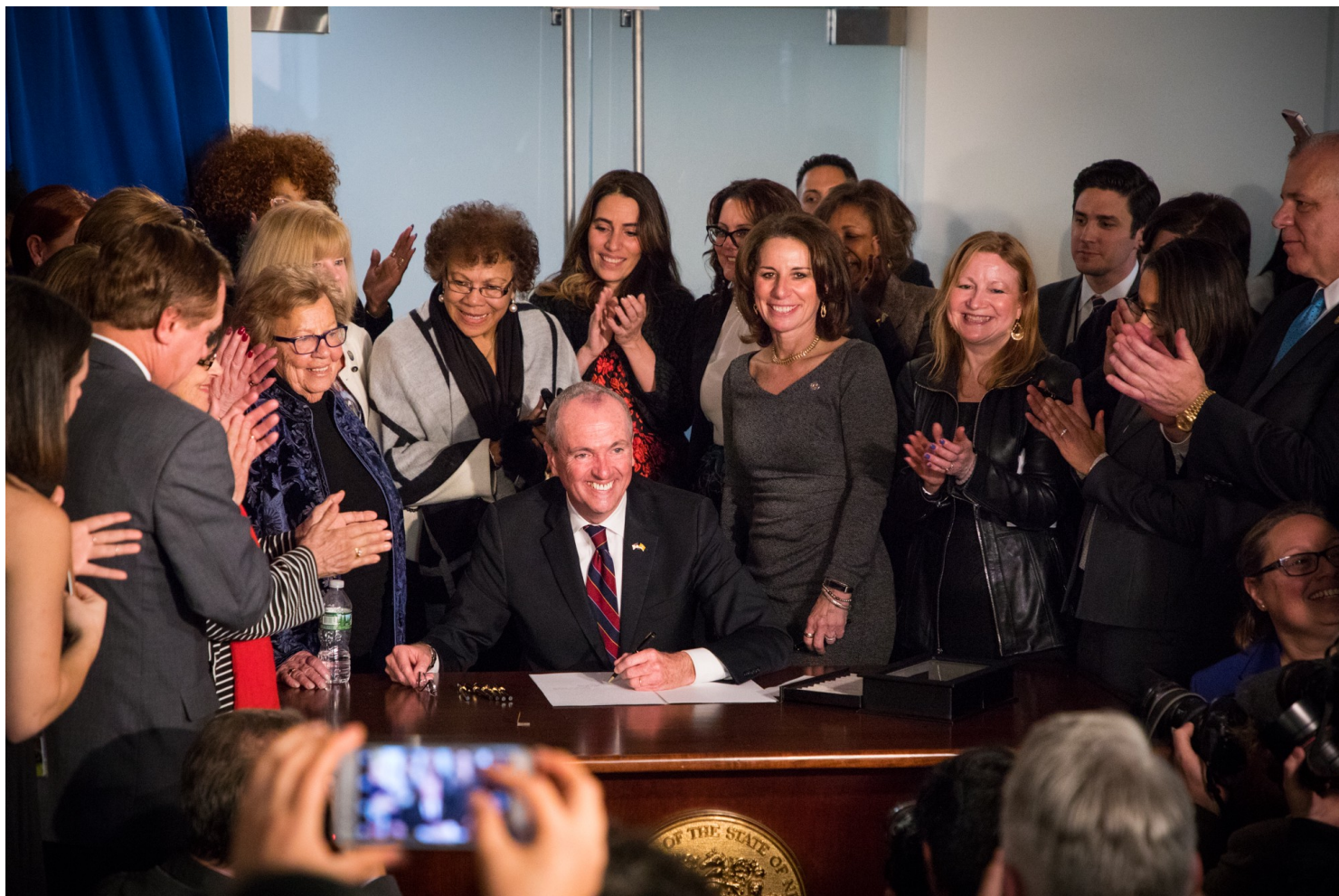
New Jersey Governor Phil Murphy signs his first Executive Order promoting equal pay for women on Tuesday, January 16, 2018.