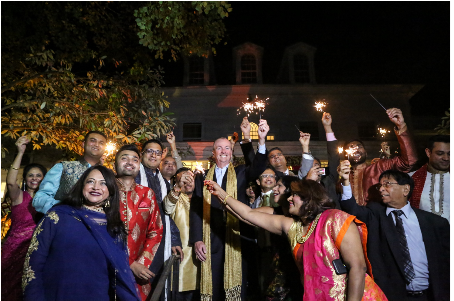
Governor Phil Murphy and First Lady Tammy Murphy celebrate Diwali at Drumthwacket on November 8, 2018.