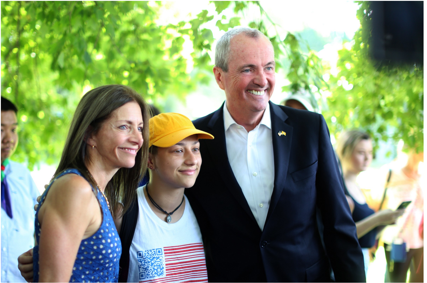
Governor Phil Murphy and First Lady Tammy Murphy join student activist Emma Gonzalez at the "Road for Change" event in Morristown on Thursday, August 9, 2018.