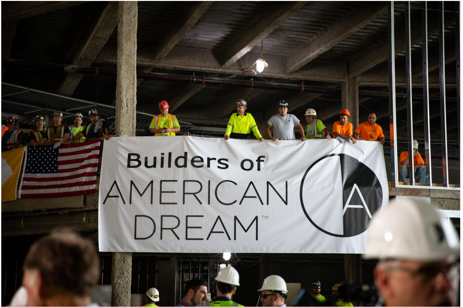
Governor Phil Murphy visits with workers at the American Dream project site in East Rutherford on August 28, 2018.