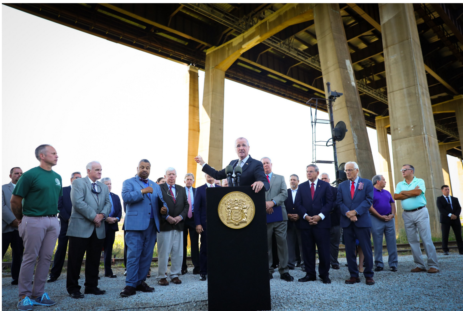
Governor Phil Murphy holds a press conference to call for federal funding for the Gateway Project in Secaucus on September 4, 2018.