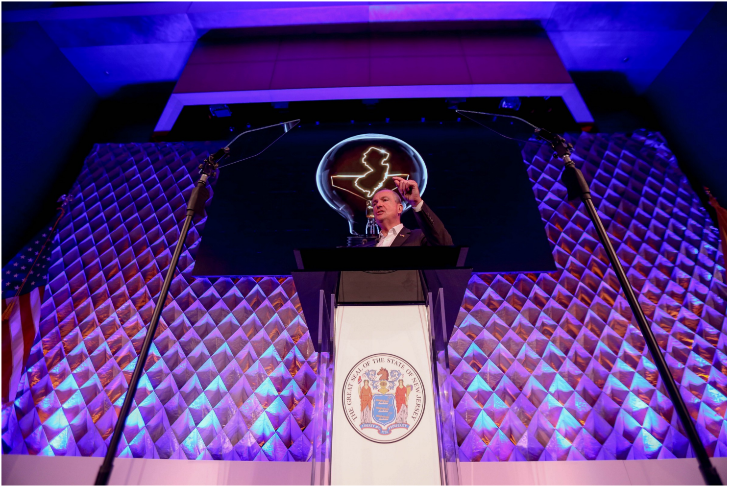
Governor Phil Murphy announces his innovation economy agenda on October 1, 2018 in Nutley, NJ.