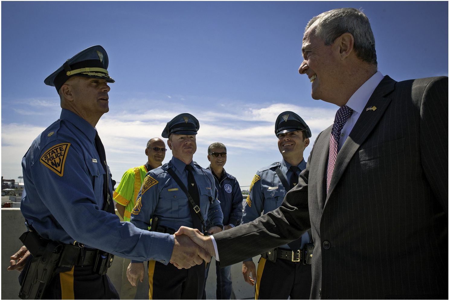
Governor Phil Murphy greets state troopers after announcing the completion of construction for the Interchange 14A Improvement Project in Bayonne on May 21, 2018.