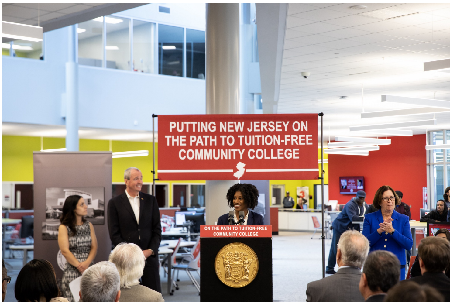
Governor Phil Murphy announces schools participating in the first year of the Community College Innovation Challenge on September 27, 2018, at Union County College in Cranford.