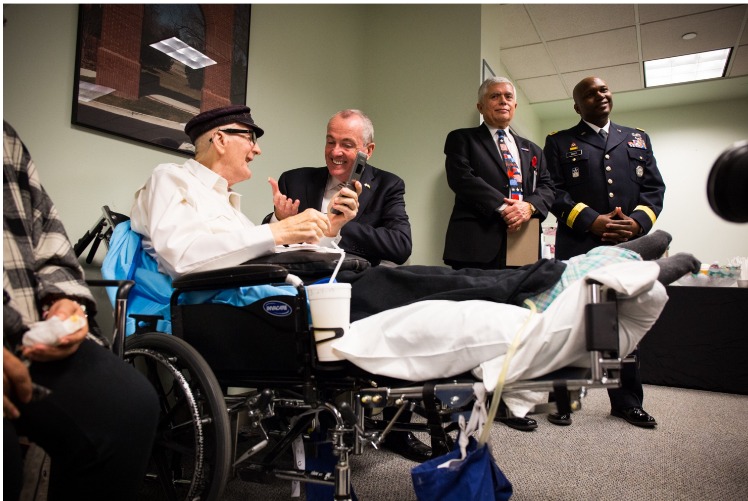
Governor Phil Murphy thanks veterans for their service at the Menlo Park Veteran's Memorial Home in Edison, New Jersey on March 29, 2018.