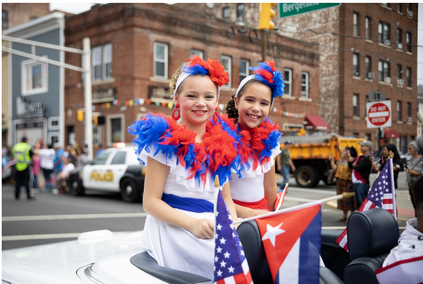
Two girls pose during the Hispanic State Parade in North Bergen on Sunday, October 7, 2018.