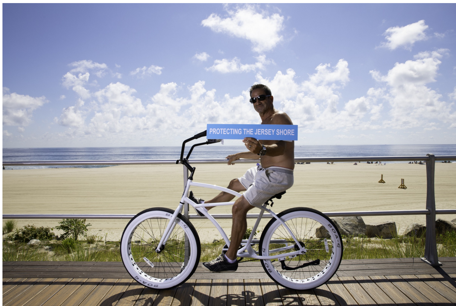
A cyclist with a beach cruiser poses for a photo moments before Governor Murphy signs legislation banning smoking on New Jersey beaches on Friday, July 20, 2018.