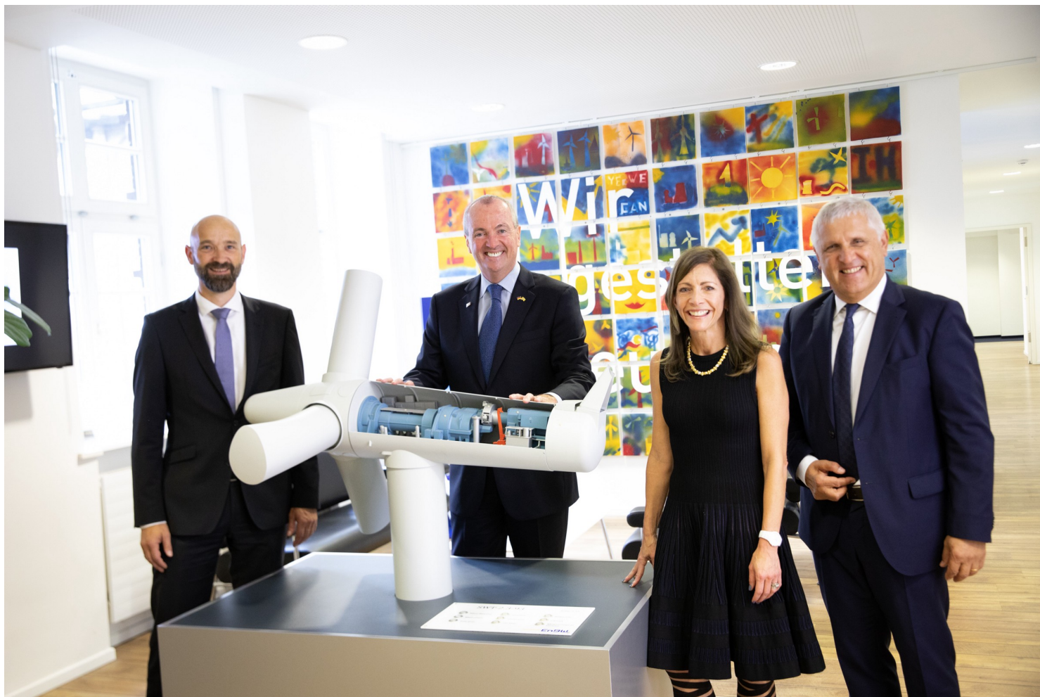
Governor Phil Murphy and First Lady Tammy Murphy meet with the directors of EnergieBW to discuss offshore wind in Hamburg, Germany on Wednesday, October 17, 2018.