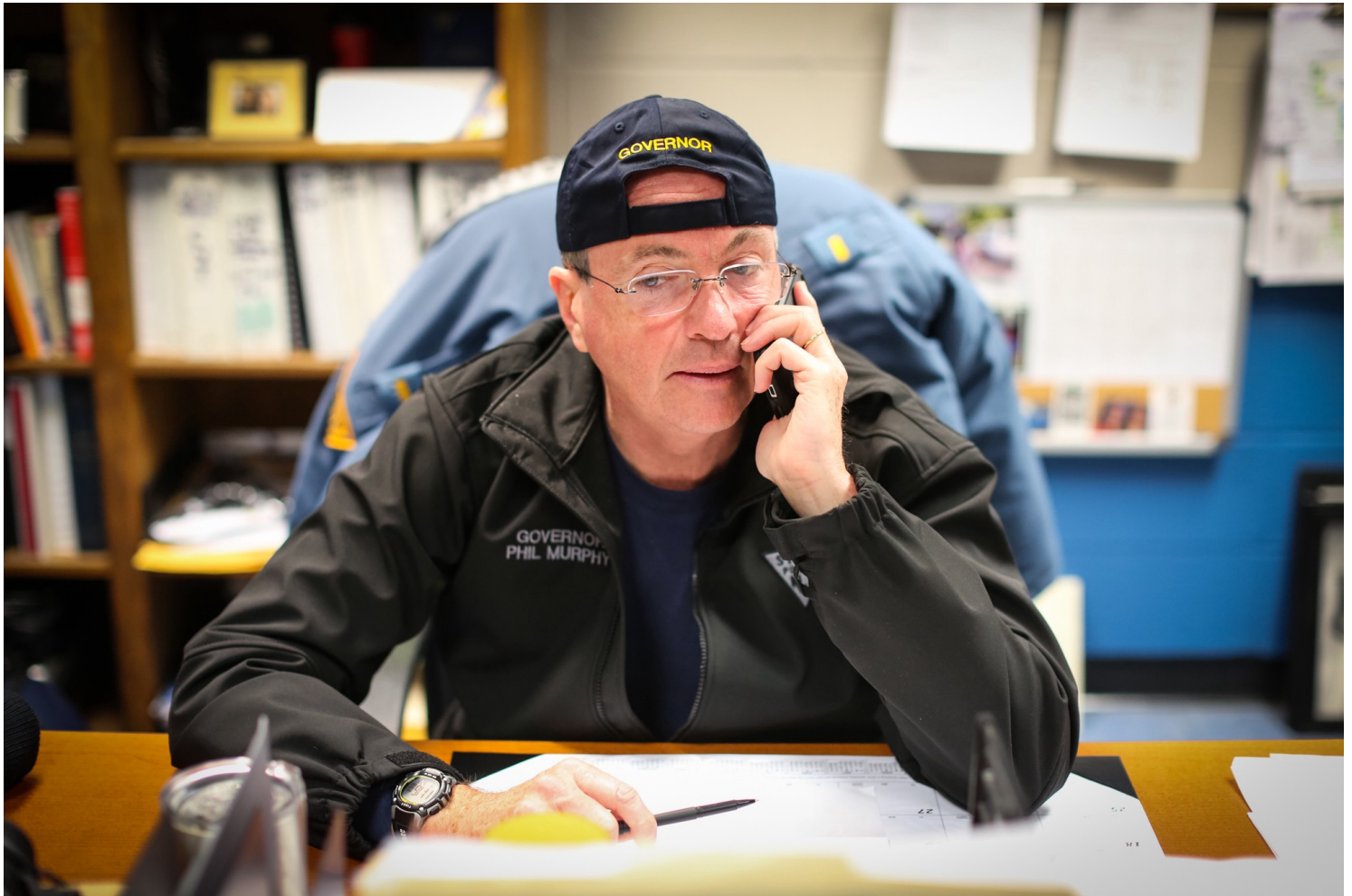
Governor Phil Murphy visits the North Division Joint Operation Center in Newark during Winter Storm Toby on Wednesday, March 21st, 2018