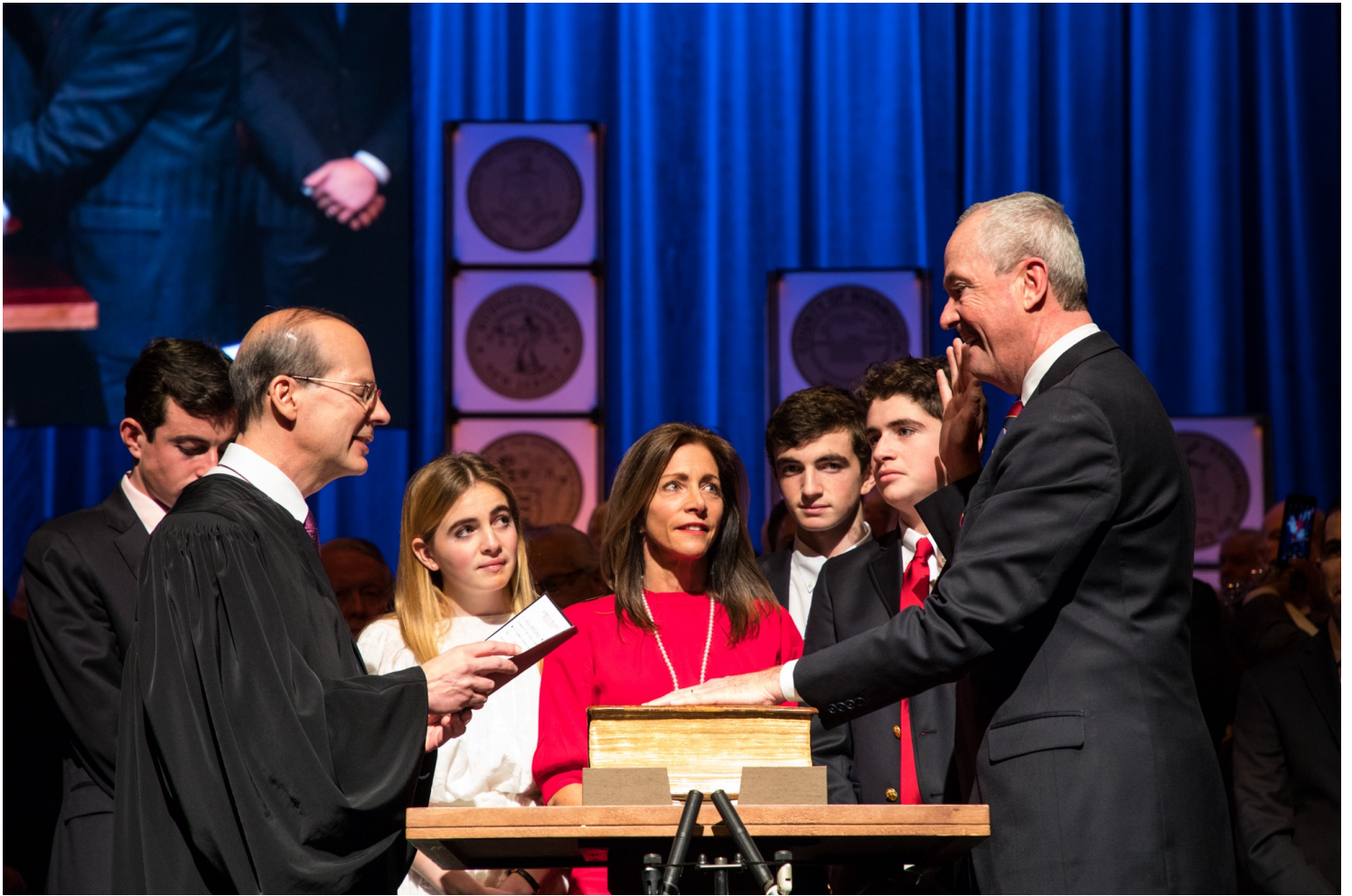
Governor-Elect Phil Murphy is sworn in as the 56th Governor of the State of New Jersey.