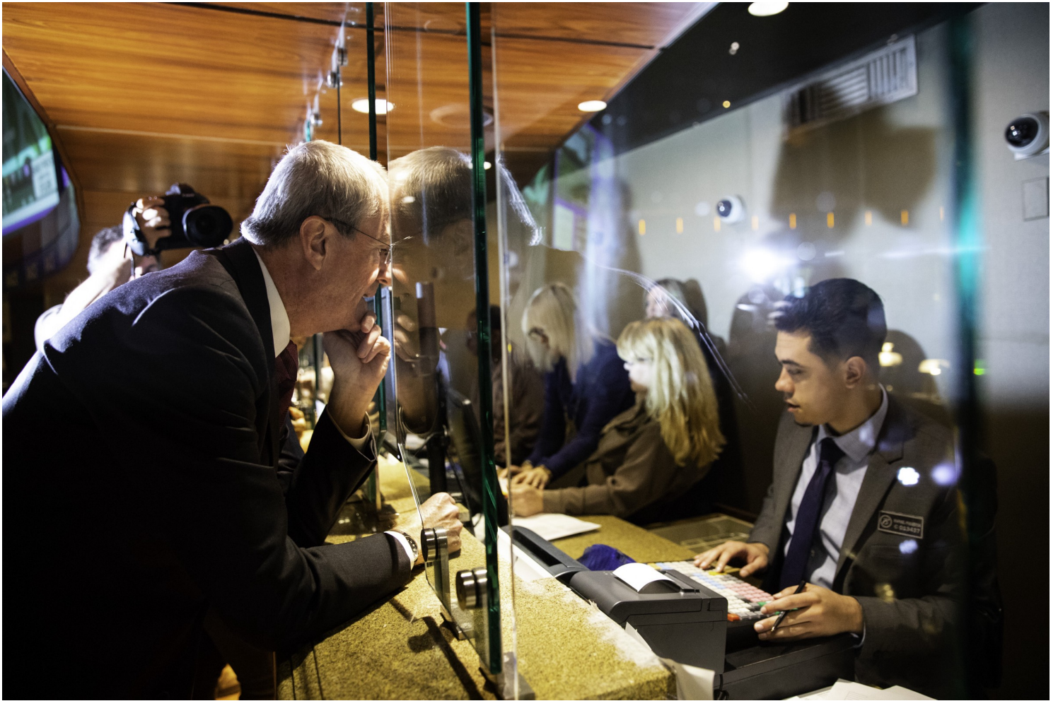
Governor Phil Murphy places his first two bets at the Borgata Casino during the first day of sports betting in New Jersey on Thursday, June 14, 2018.