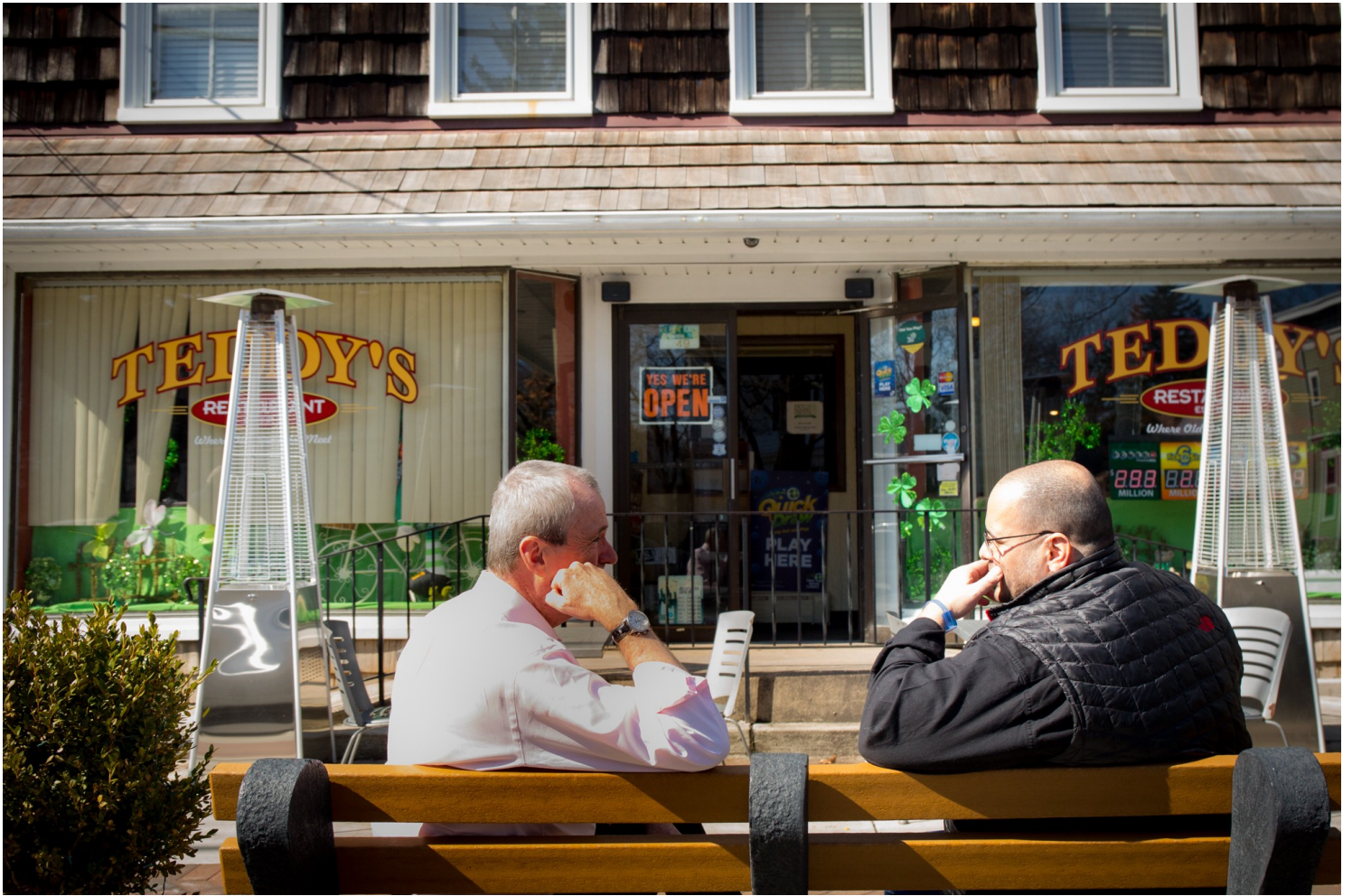
Governor Phil Murphy visits Teddy's Luncheonette in Cranbury, NJ on Tuesday, February 26, 2018.