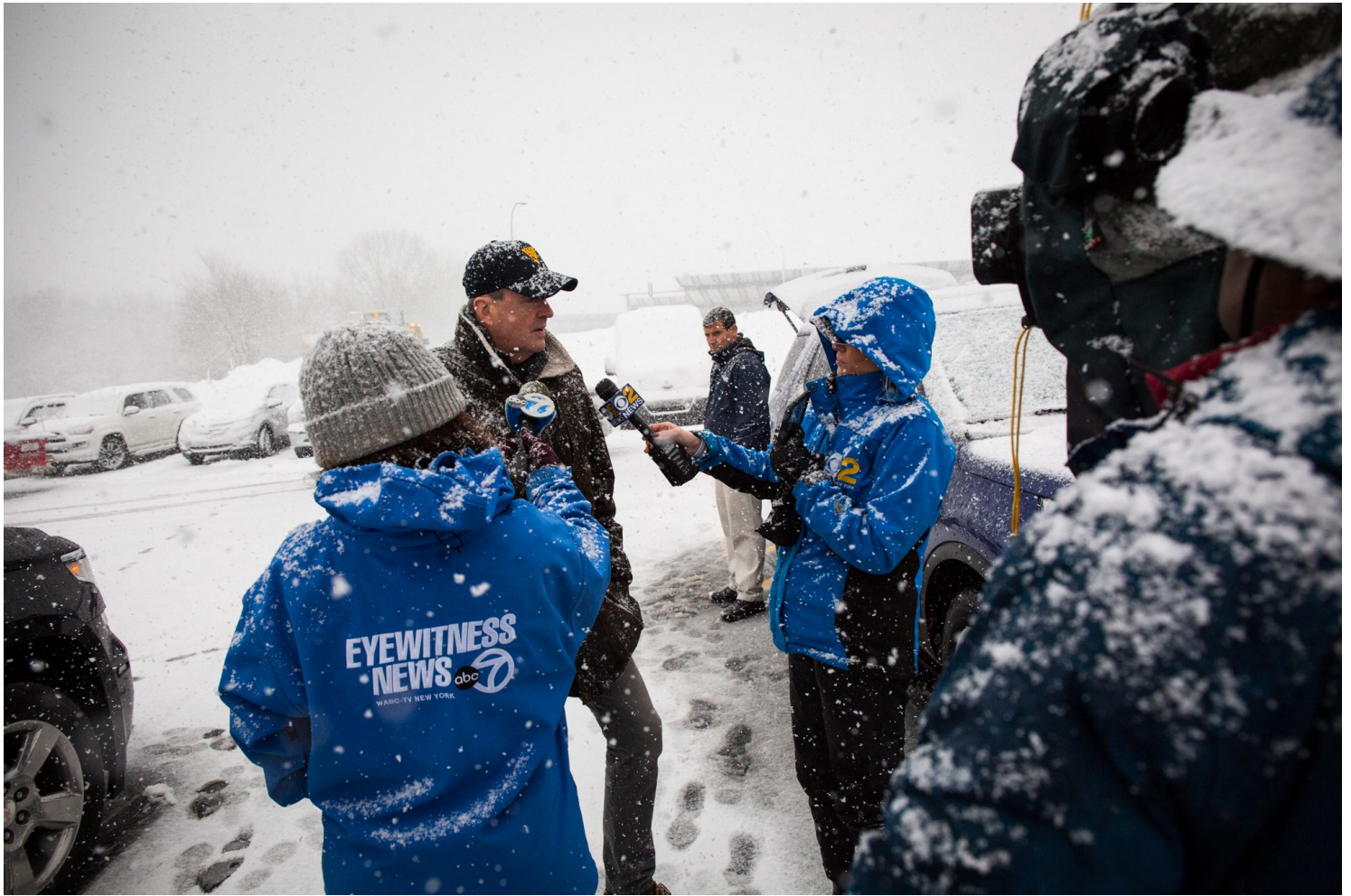
Governor Phil Murphy conducts an interview after visiting utility workers at the County College of Morris during a winter nor'easter storm on Wednesday, March 7, 2018.