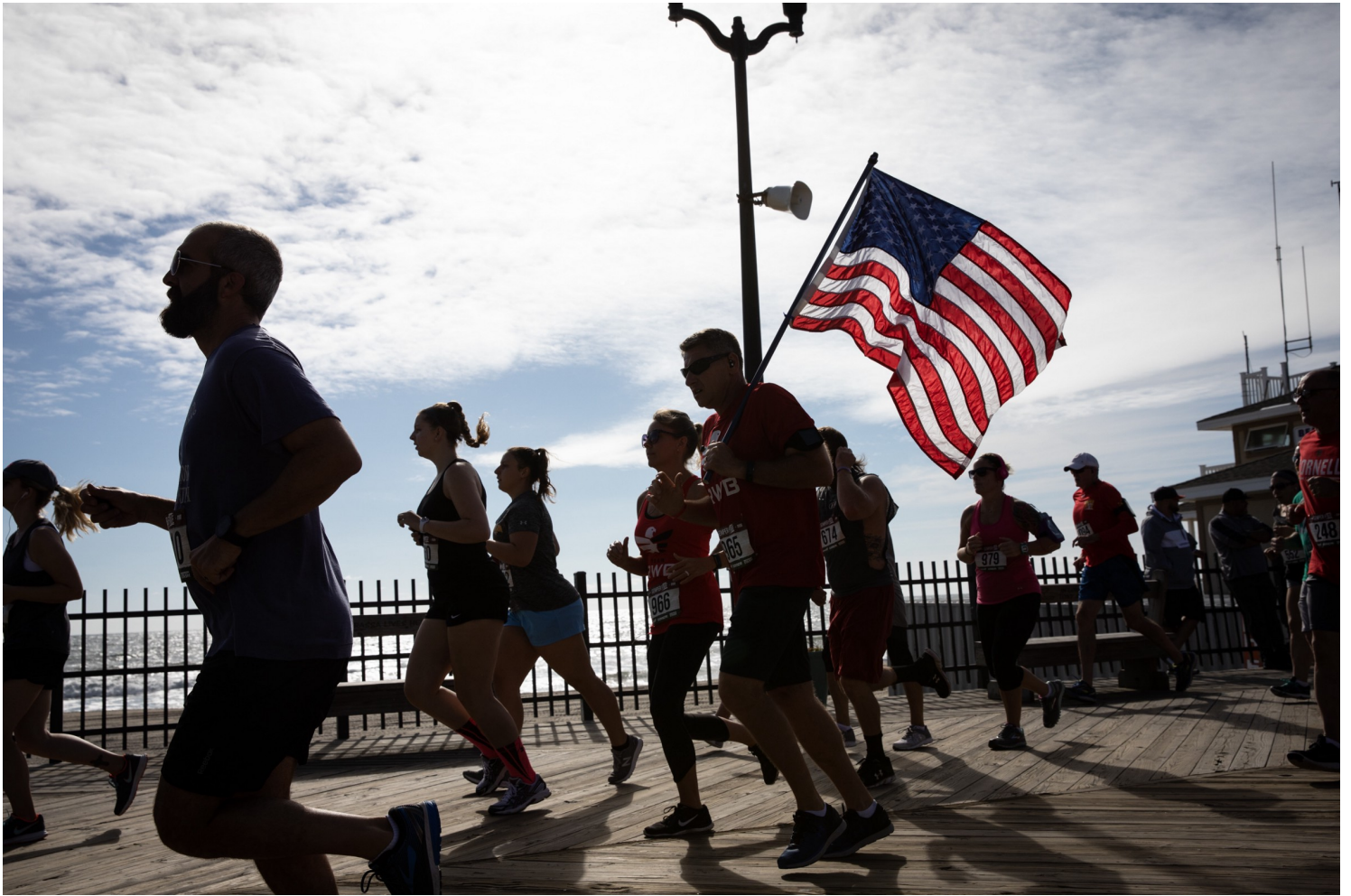
Governor Murphy and First Lady Tammy Murphy run in the Seaside Semper Five 5K on Saturday, September 15, 2018.