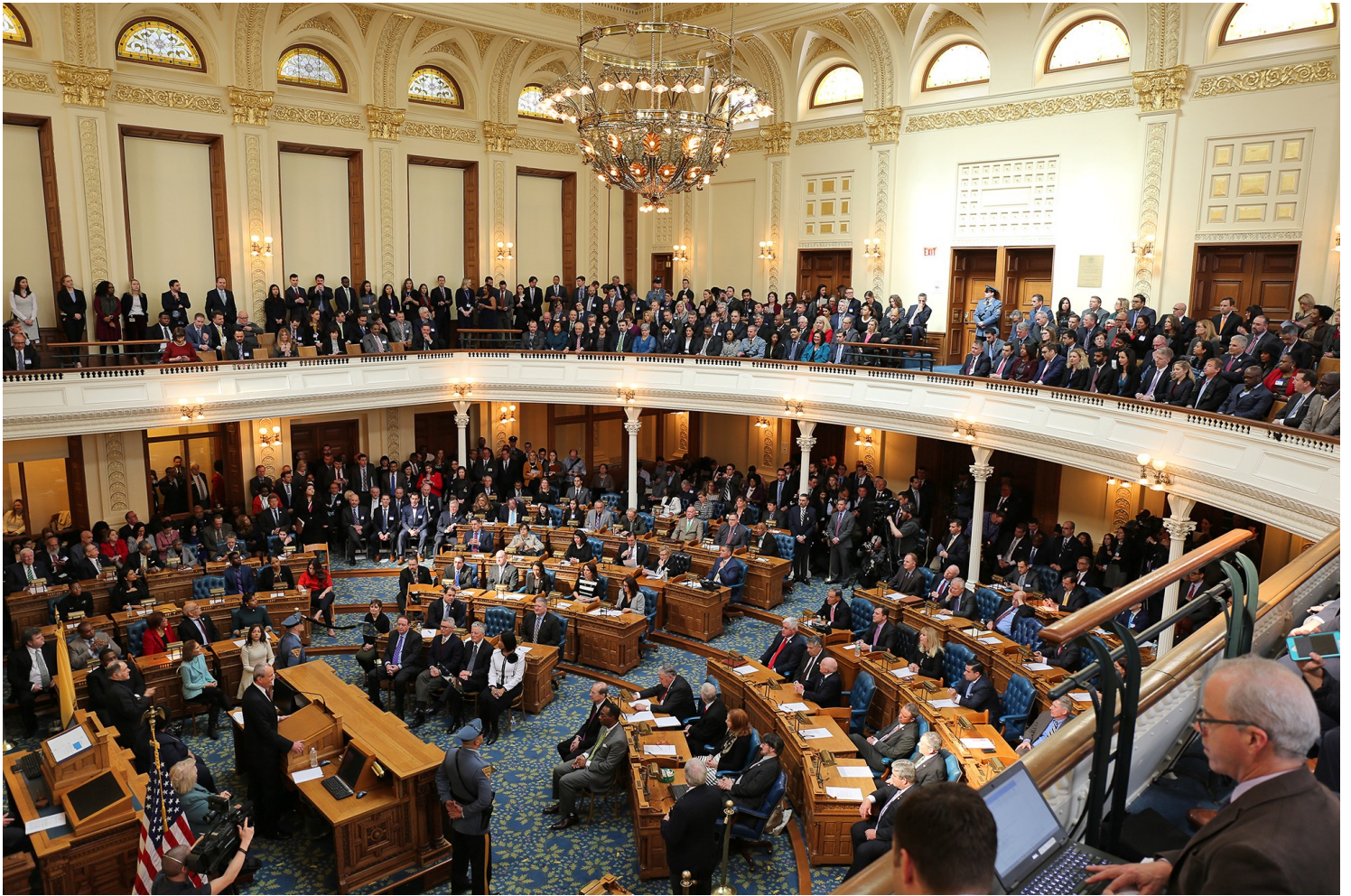
Governor Phil Murphy delivers his Fiscal Year 2019 Executive Budget Address in the Trenton on March 13, 2018.