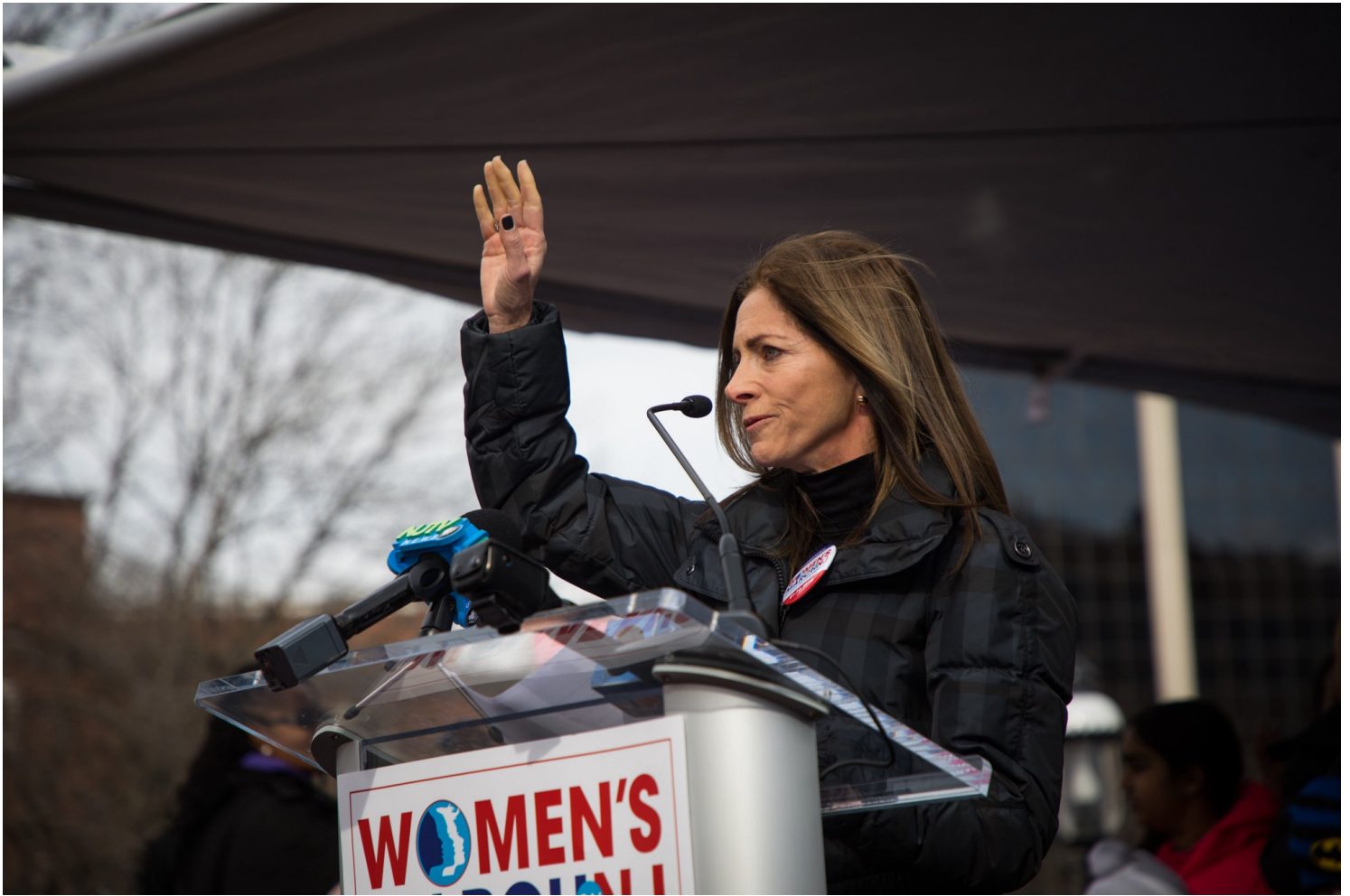
First Lady Tammy Murphy makes public her sexual assault story and marches in the Women's March in Morristown, New Jersey on Saturday, January 20, 2018.