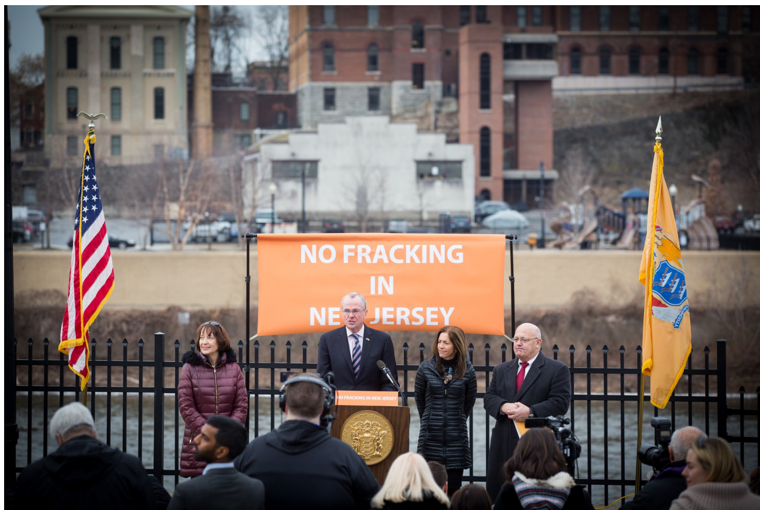
Governor Phil Murphy and First Lady Tammy Murphy declare support for a fracking ban in the Delaware River Basin in Phillipsburg on Thursday, February, 1st, 2018.