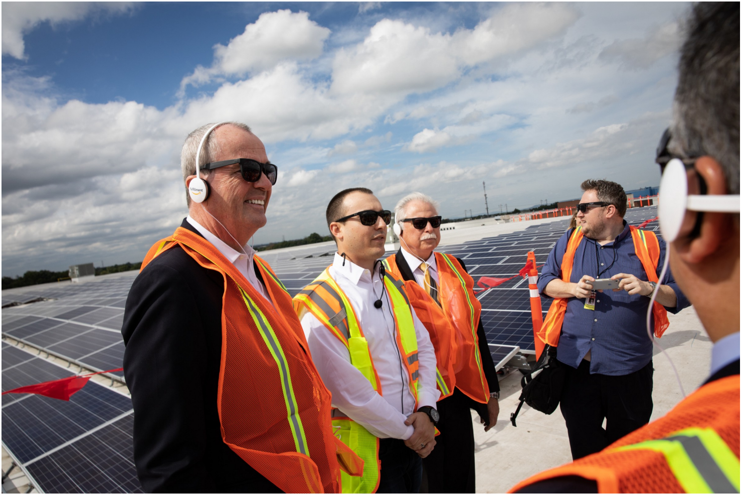
Governor Phil Murphy attends the grand opening of Amazon's fulfillment center on September 24, 2018, in Edison.