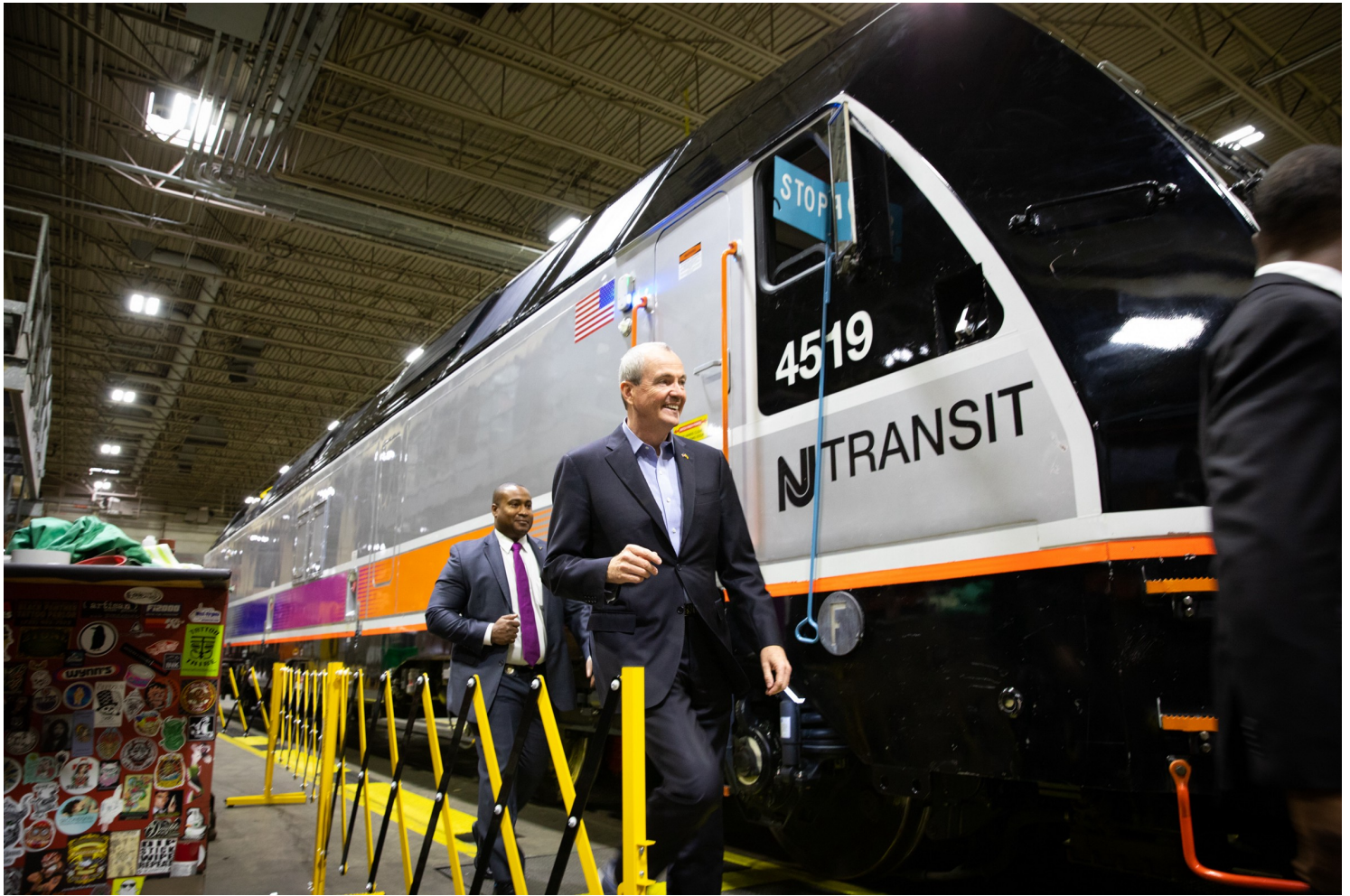
Governor Phil Murphy announces NJ TRANSIT will meet the federally-mandated Positive Train Control (PTC) deadline on December 17, 2018, at NJ TRANSIT's Meadows Maintenance Complex.