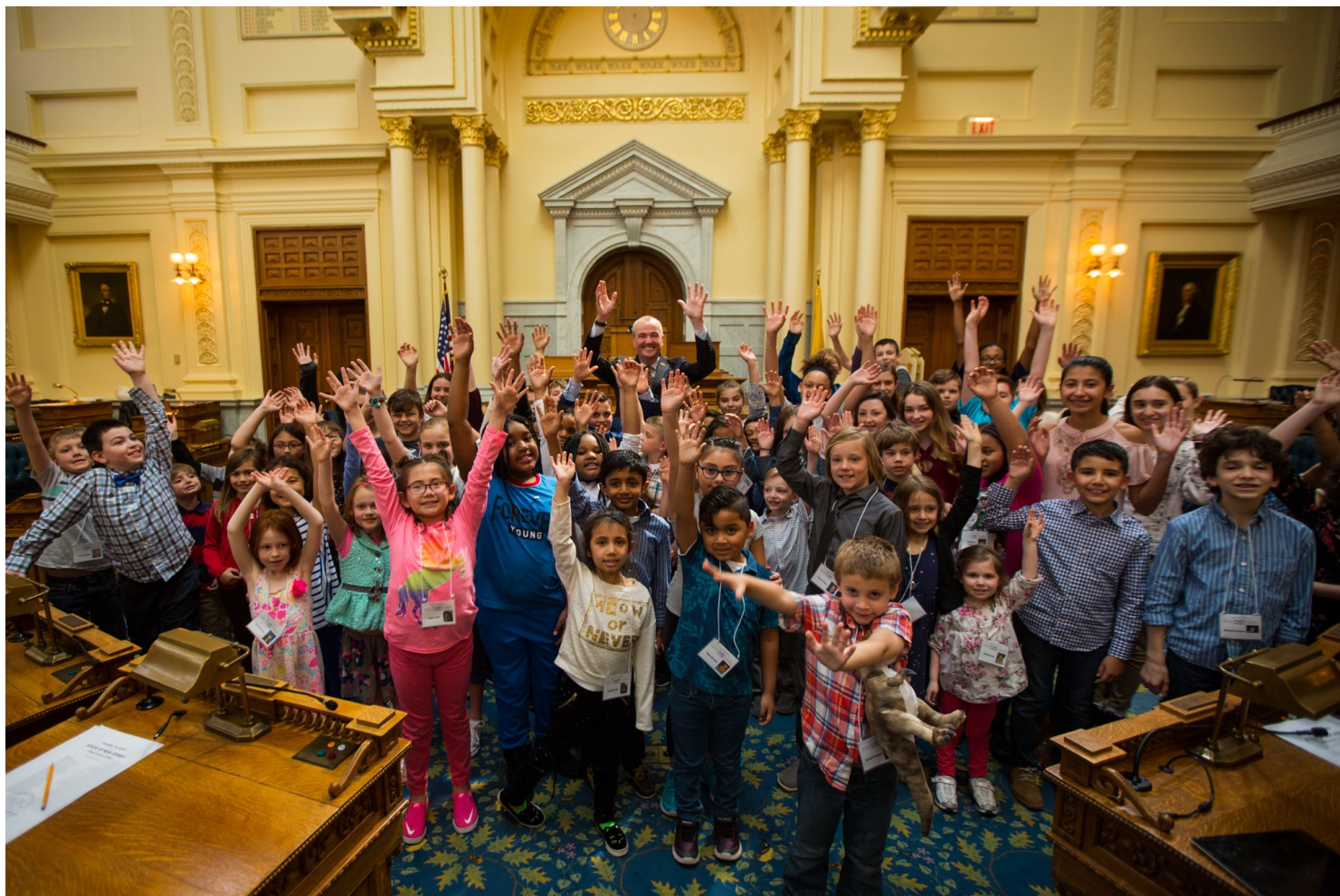
Governor Phil Murphy visits children during "Take Your Children To Work Day" at The Annex in the Trenton State House on Thursday, April 26, 2018.