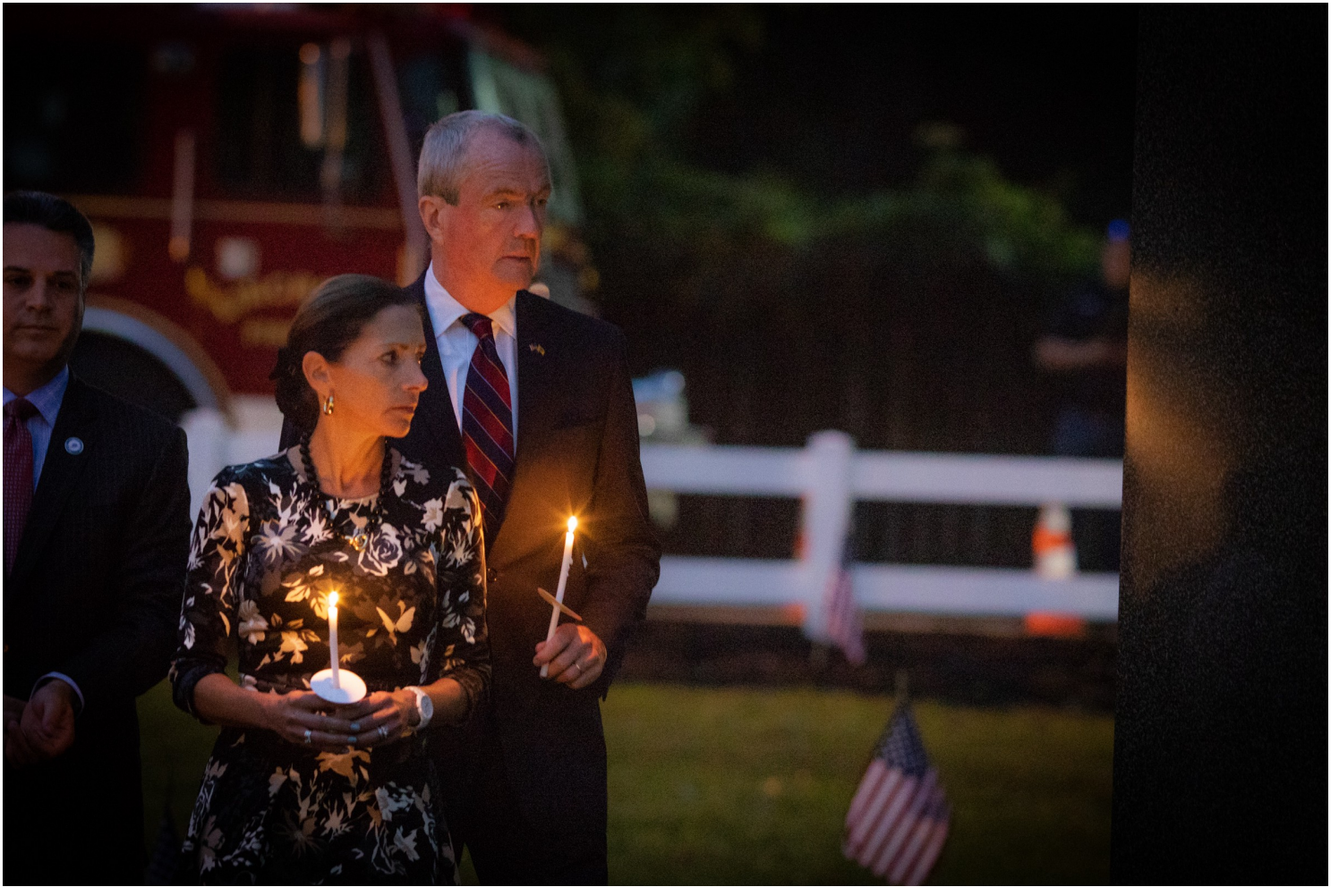
Governor Phil Murphy and First Lady Tammy Murphy attend the annual remembrance ceremony at the Middletown World Trade Center Memorial on Tuesday, September 11, 2018.