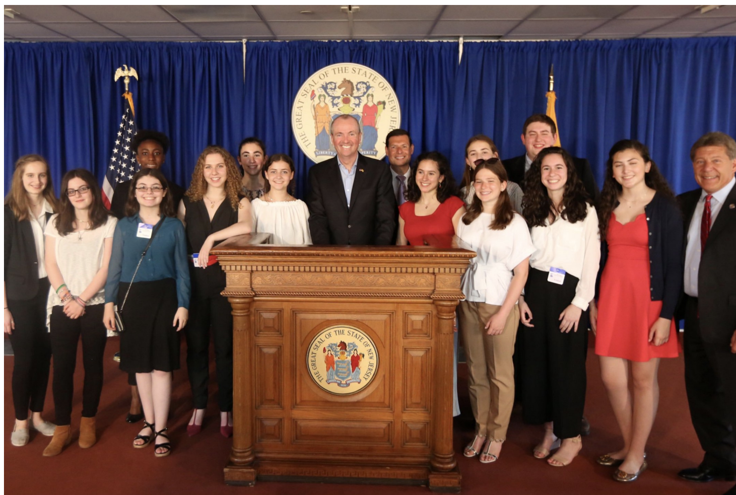
Governor Phil Murphy stands with student activists from Maplewood and South Orange who led school walkouts against gun violence in Trenton on May 24, 2018.