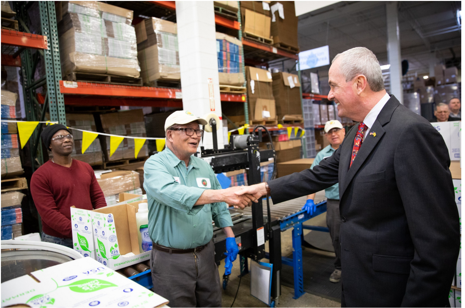
Governor Phil Murphy holds a press conference on raising the minimum wage statewide to $15/hour at Earth Friendly Products in Parsippany on December 11, 2018.