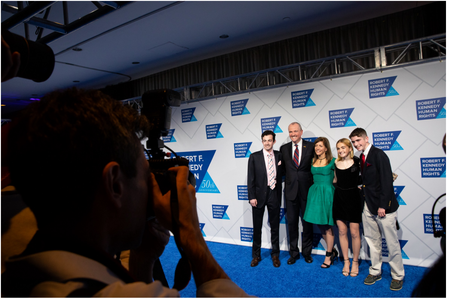
Governor Phil Murphy and family attend the Robert F. Kennedy Ripple of Hope Awards at the Hilton in New York City on December 12, 2018.