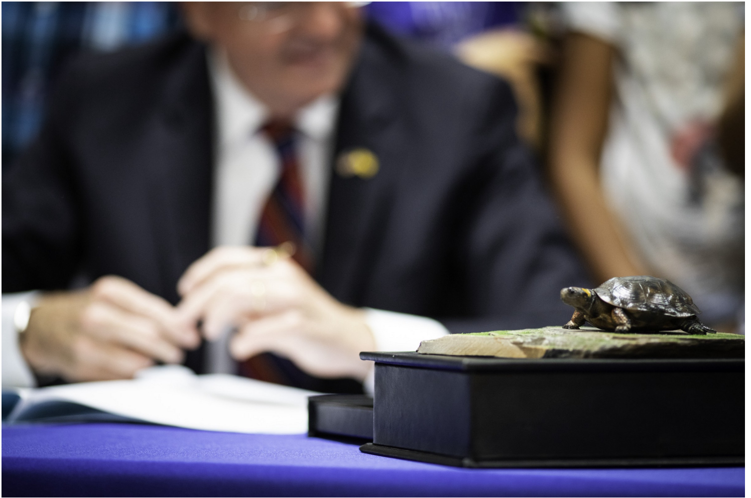
Governor Phil Murphy signs legislation designating the Bog Turtle as the official reptile of New Jersey on Monday, June 18, 2018. Edwin J. Torres Governor's Office.