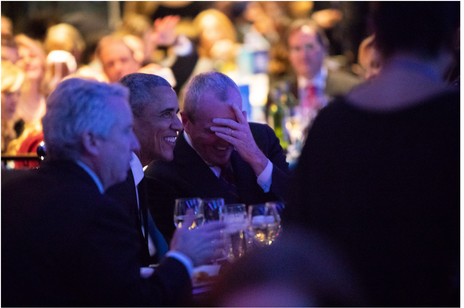
Governor Phil Murphy and President Obama share a moment during the RFK Ripple of Hope Awards ceremony in New York City.