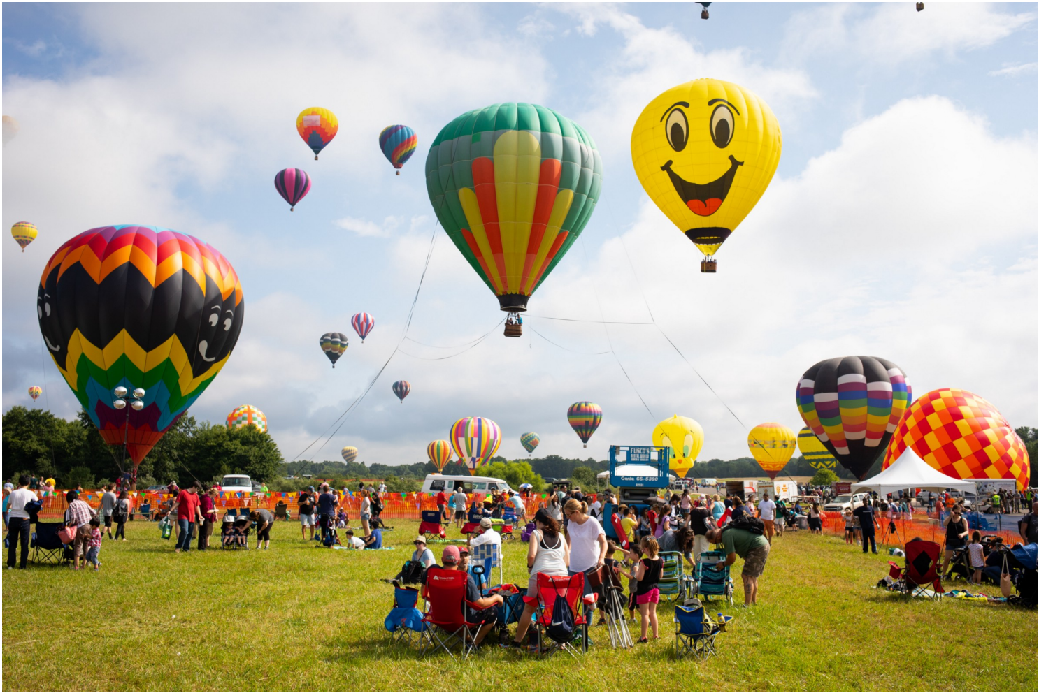
New Jerseyans enjoy the 36th Annual QuickChek Festival of Ballooning.