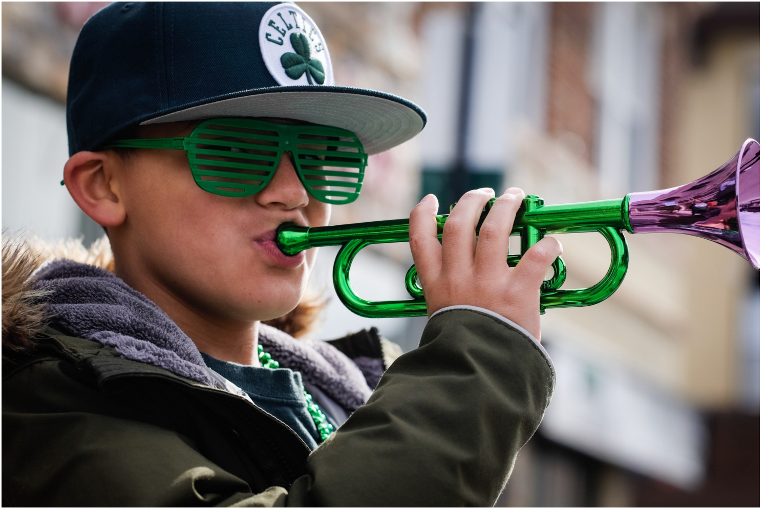
A little boy marches in the 40th Annual St Patrick's Day parade in Nutley, NJ on Saturday, March 3rd, 2018.