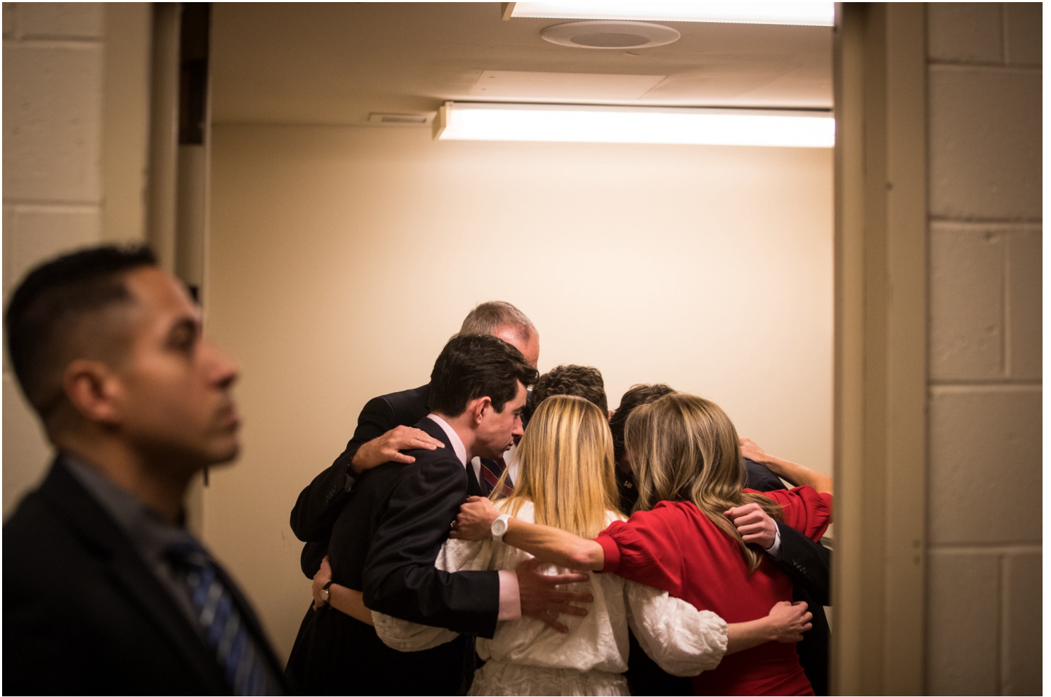
Governor-elect Murphy has a quick huddle with his family before being sworn in during his inauguration at the War Memorial in Trenton on Tuesday, January, 16, 2018.