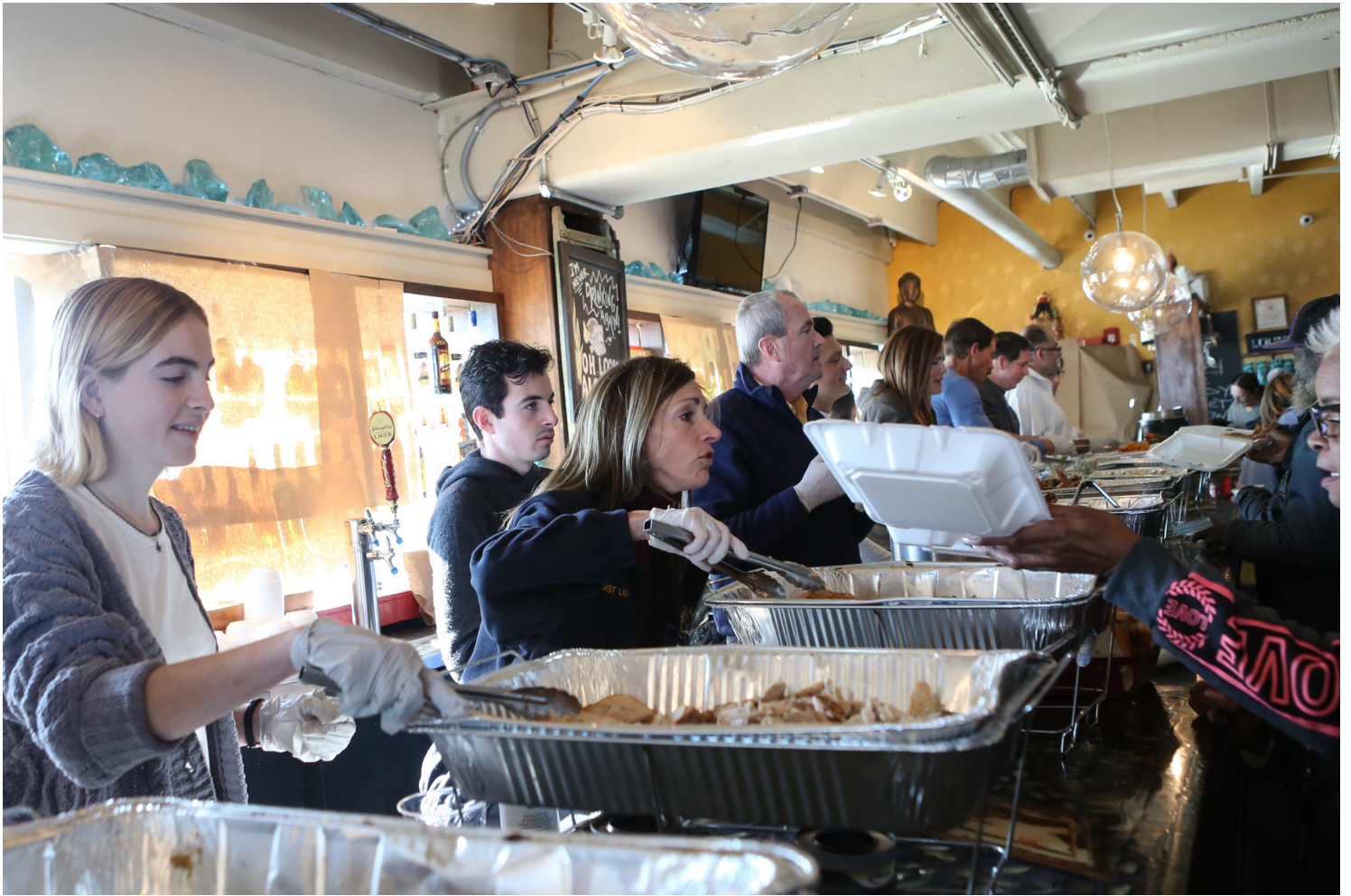
The Murphy family volunteers at a food kitchen for Thanksgiving on November 22nd, 2018.