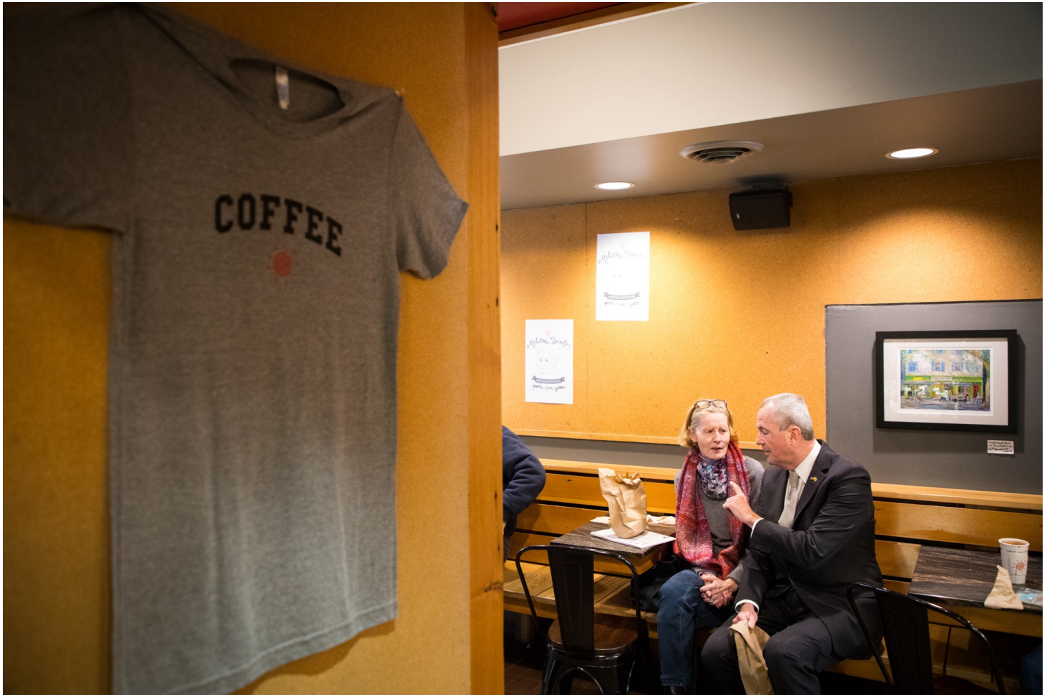
New Jersey Governor Phil Murphy visits Small World Coffee and chats with residents in Princeton on Friday, January 19, 2018.