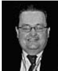
Leon Flanagan State Representative