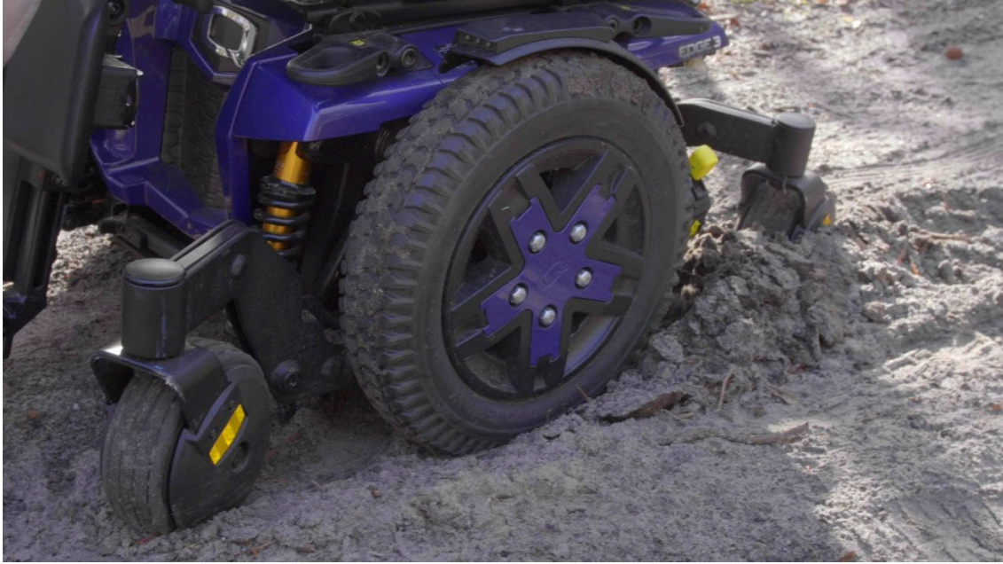
A soft spot on the trail