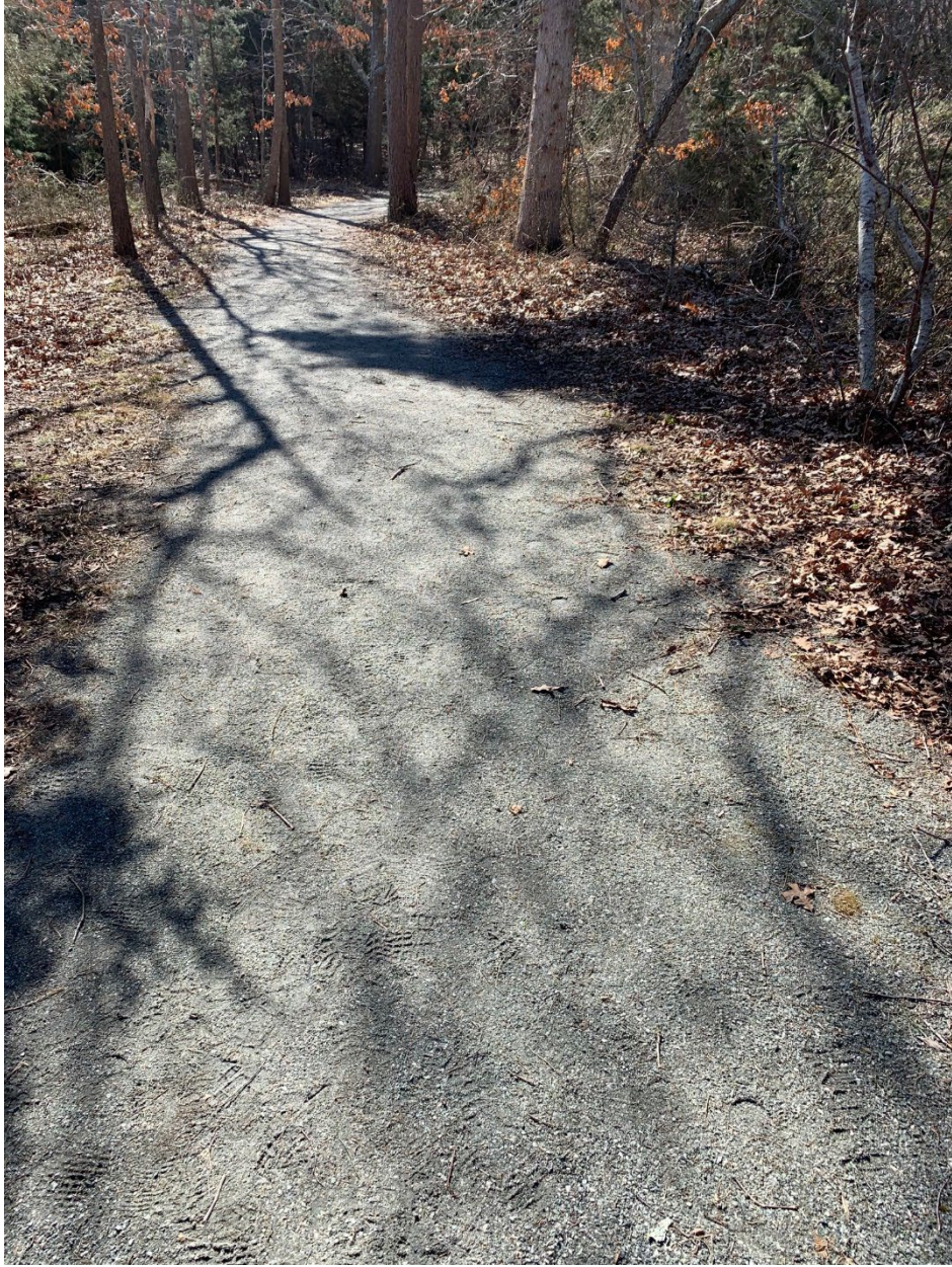
Leeds Ecotrail at Forsythe National Wildlife Refuge