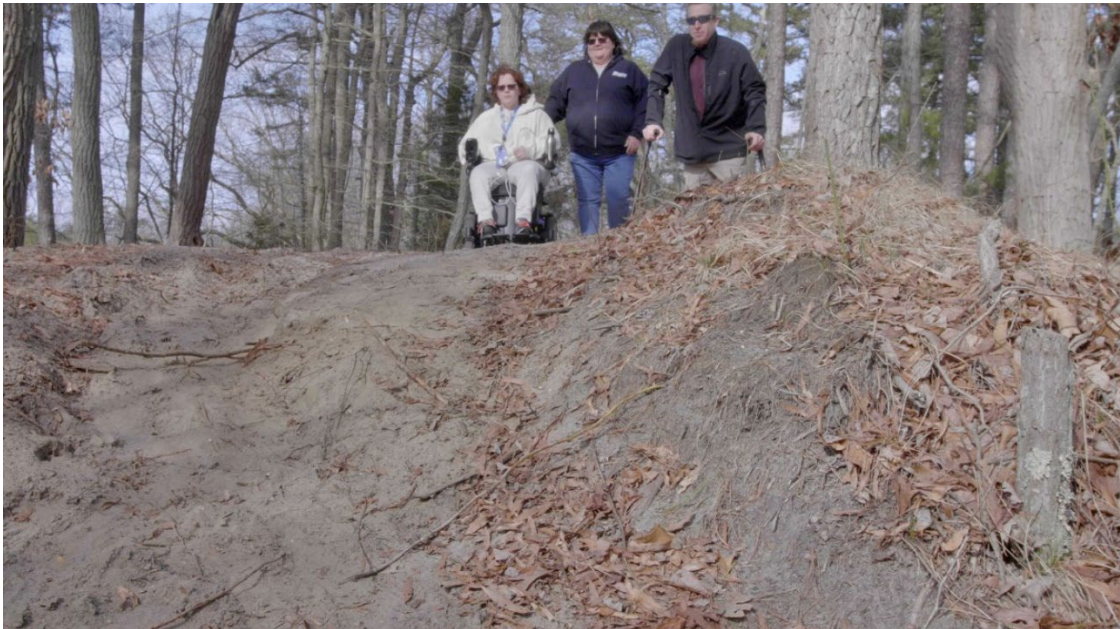
The biggest dip in the trail