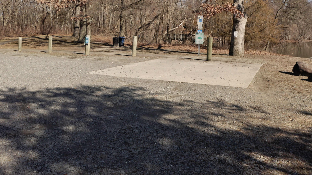
Parking lot on Magnolia Road