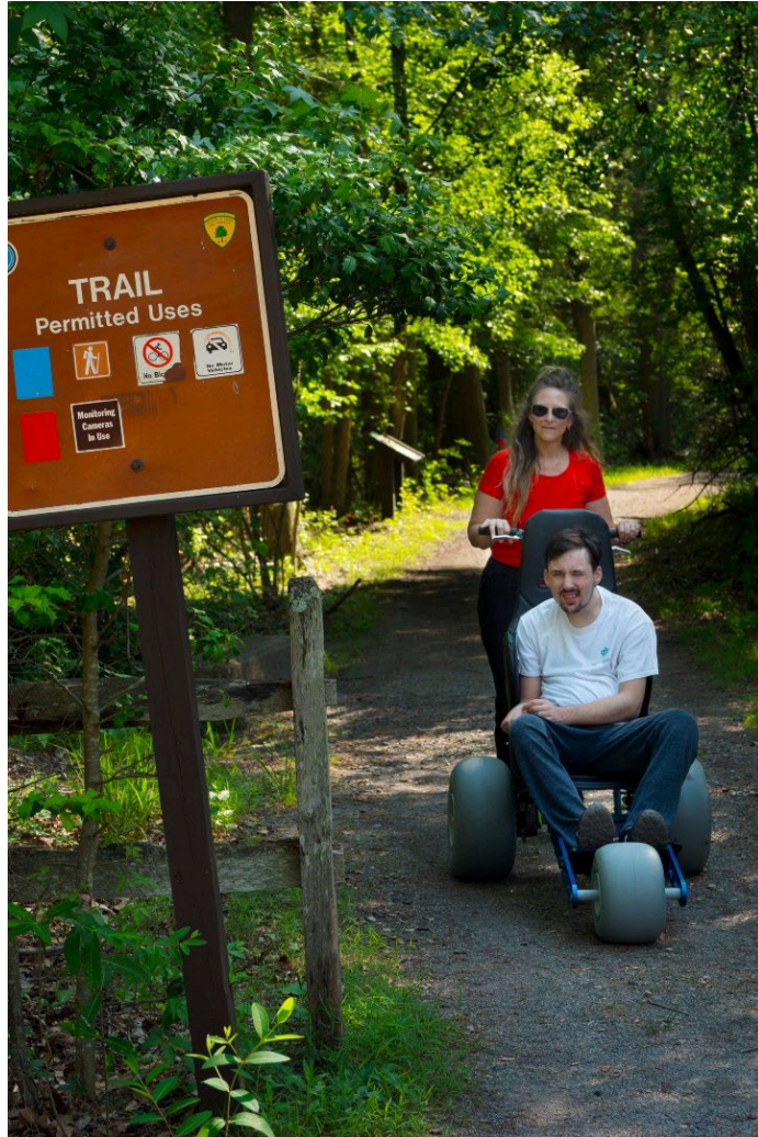
Atsion Recreation Area Red Trail