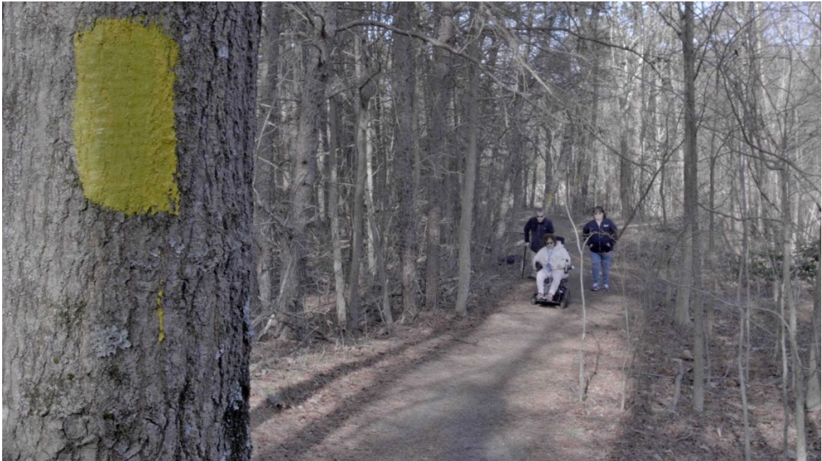
A flat, stable stretch of the trail