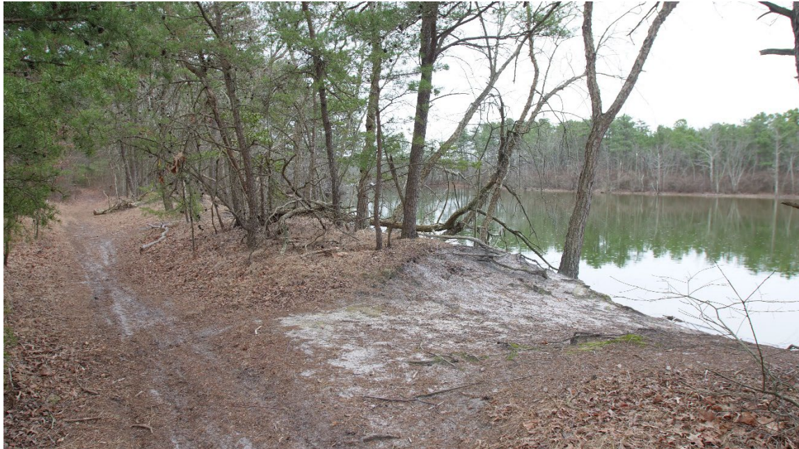
Lake access point along the trail