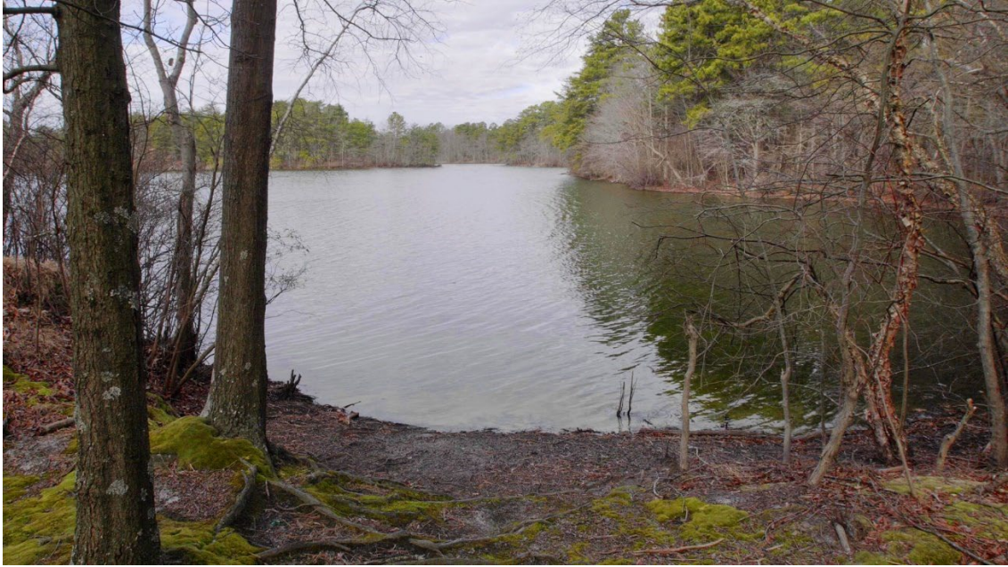
A view of Pemberton Lake from the trail