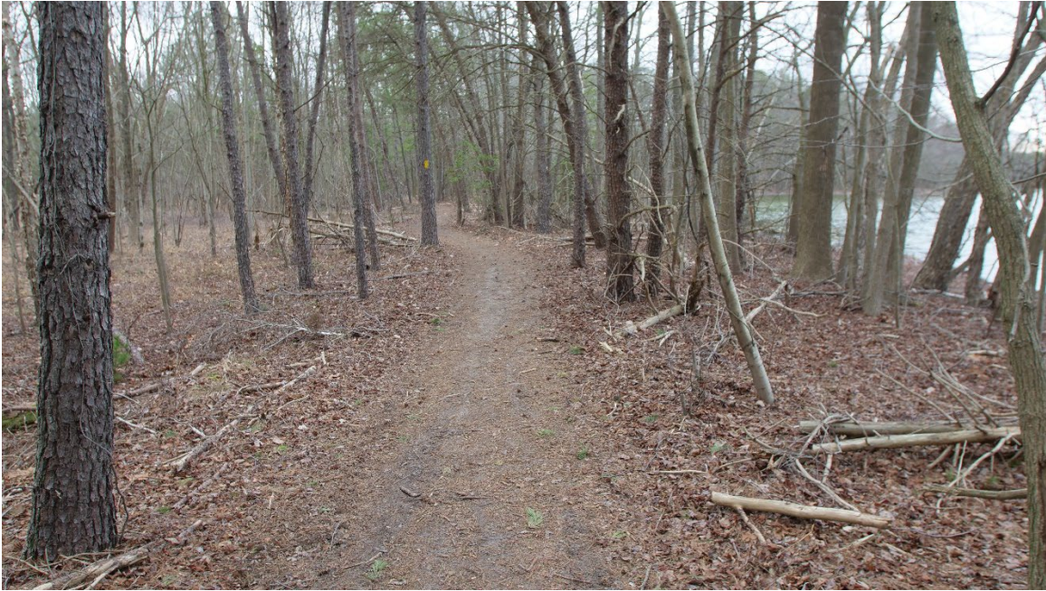
Typical stretch of the trail with Pemberton Lake to the south (left)