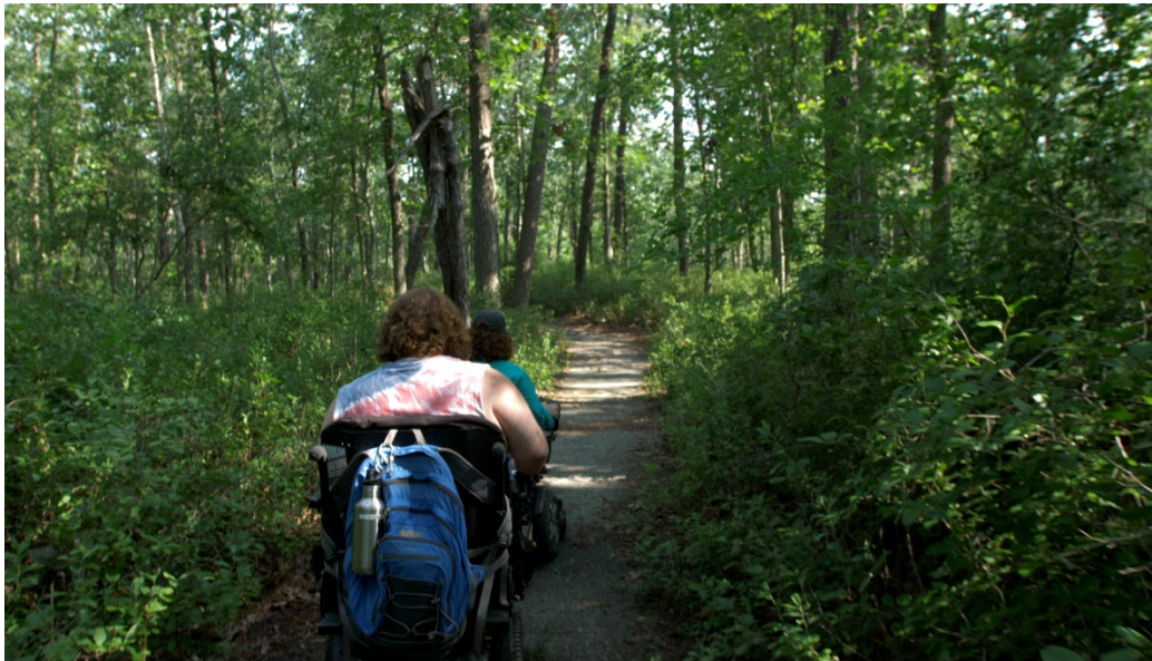
Batsto Red Trail