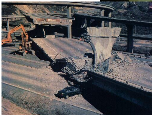
Damage to bridges during past earthquakes.