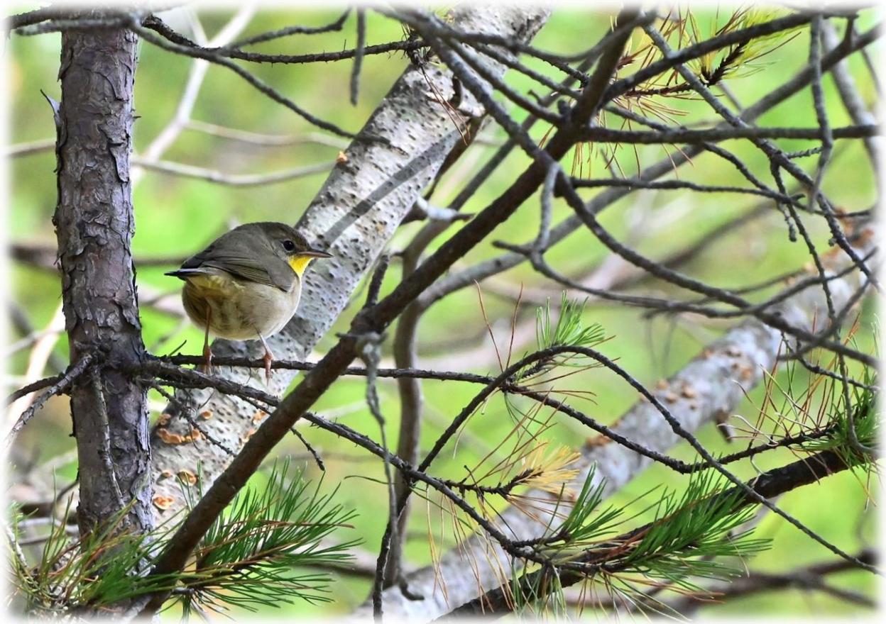
A common yellowthroat warbler at Cloverdale Farm County Park in the Pinelands in October