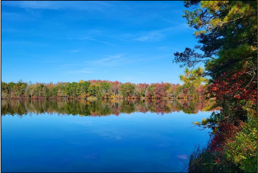
Above: The Commission shared 54 tweets/retweets on its X account in October, including this photo of fall foliage reflecting on Atsion Lake in Wharton State Forest in the Pinelands.