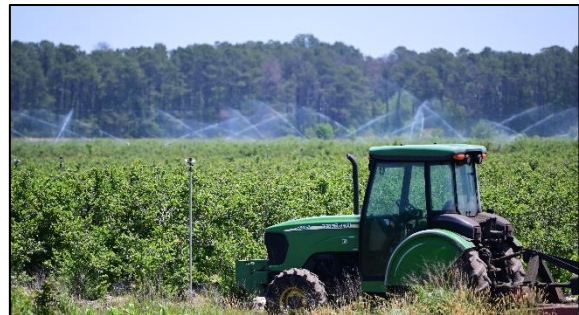
Above: The July 2022 severance of 11.25 Pinelands Development Credits resulted in the permanent protection of 224.48 acres of this blueberry farm in Hamilton Township, Atlantic County.