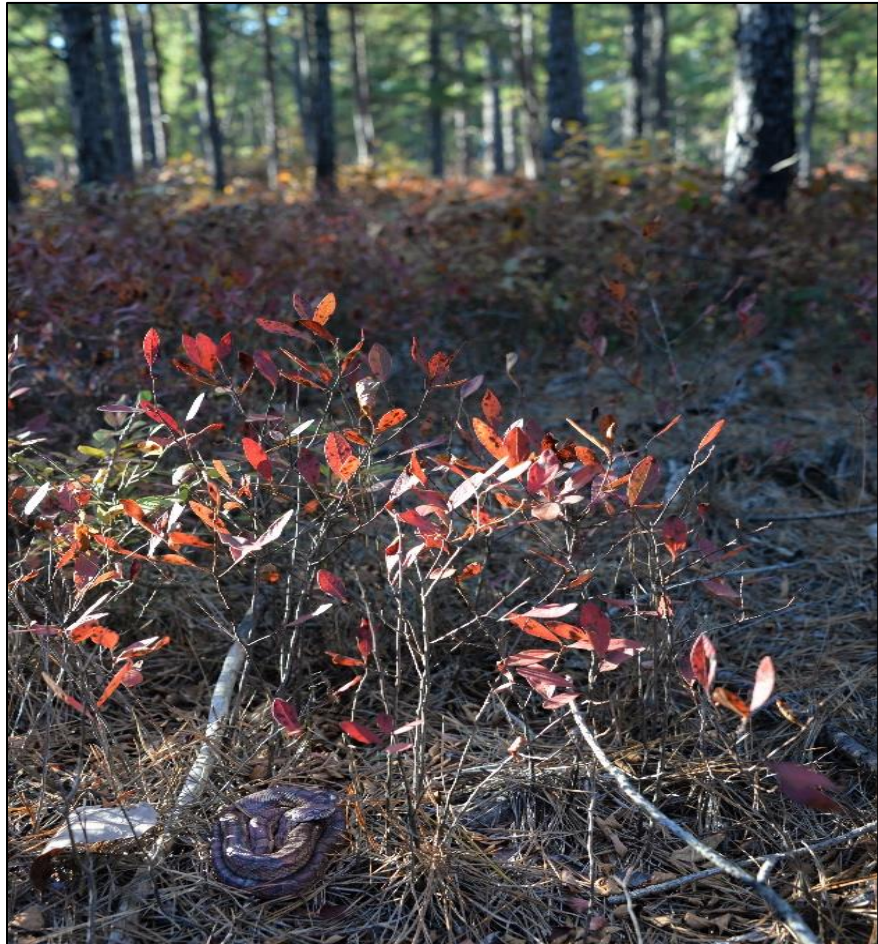
Above: Radio tracked corn snake coiled about 3 feet from her den entrance. Her den entrance is the dark area in the center right portion of the background. She is waiting to shed before hibernation.