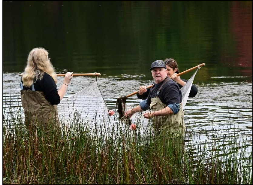
Above: Commission staff helped local students to catch fish during the annual, Pinelands-themed World Water Monitoring Challenge event at Batsto Lake on October 20, 2023.

Commission staff delivered a presentation and provided a guided tour of the agency's rain and bog gardens for approximately 20 members of the Long Beach Island Garden Club on October 5, 2023. Staff also led the group on a hike.