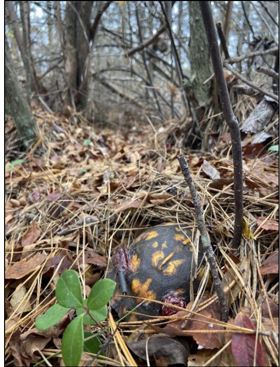
Above: Female box turtle resting in her leaf litter form and showing the radio transmitter epoxied on the left side of her shell and an iButton to log shell temperature glued on the right side of her shell.