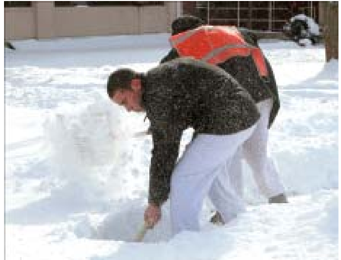
ChalleNGe cadets shovelling snow as part of their community service at Fort Dix.

The cadets learn the importance of community service by shovelling snow for families of deployed