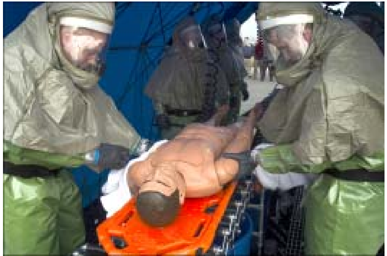
Members of the 177th Fighter Wing Medical Group demonstrate decontamination procedures for a non-ambulatory patient.

Victims who are unable to clean themselves are placed on a stretcher. The team removes the victim's clothing and places the patient and stretcher on a 16-foot long track. As the victim is rolled down the track,