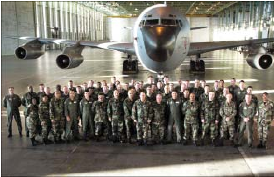
Members of the 108th Air Refueling Wing gather in a hangar at Istres Air Base for one last photo before the base closes its doors.

By Senior Airmen Elizabeth Pritchard, 108ARW/PA