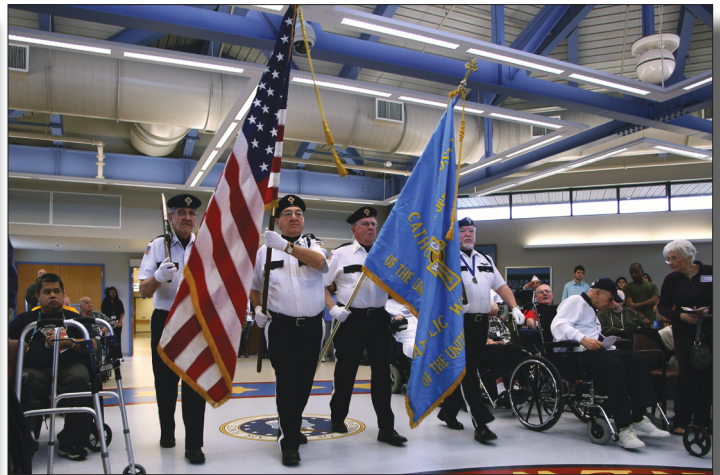
Color Guards from Fr Washington Post 1710, Catholic War Veterans of the United States of America, Inc., post the colors at the Veterans Day celebration at the New Jersey Veterans Memorial Home at Paramus Nov. 12, 2013. Following the Veterans Day ceremony, a 6-by-10-foot acrylic mural named "Lest We Forget" was unveiled at the front lobby of the Home.