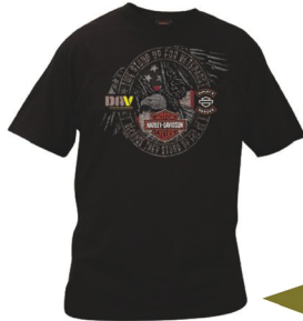
Stratman Harley's Heros Collectible T-shirt all proceeds from T-shirt sales goes to the DAV