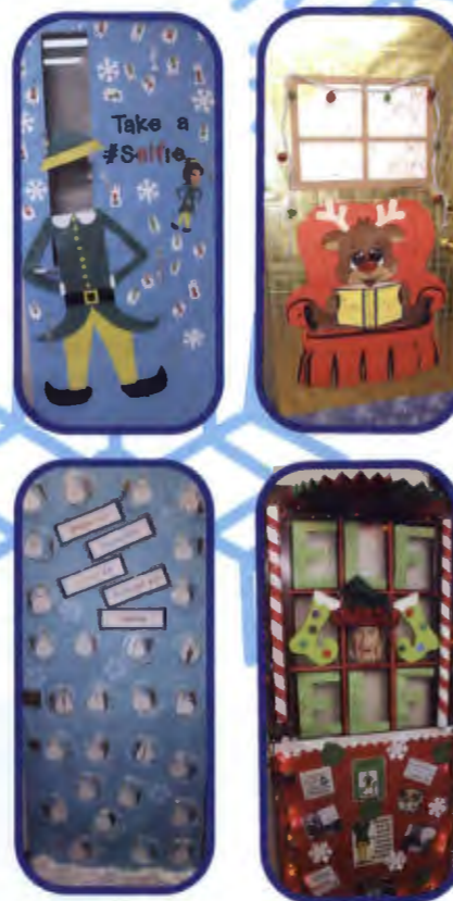
A few of this year's winners!