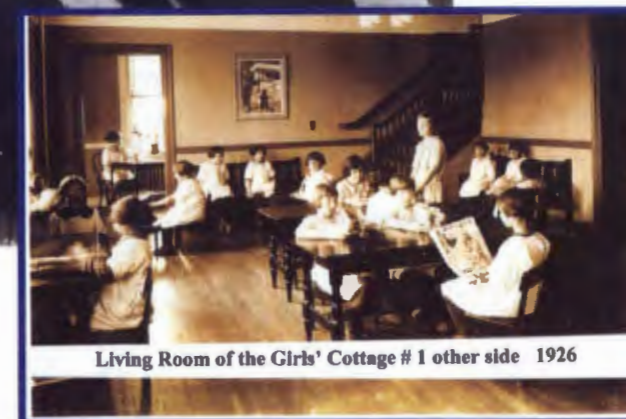
Living Room of the Girls' Cottage # 1 other side 1926

New Jersey School of the Deaf: 320 Sullivan Way, West Trenton, New Jersey 08628