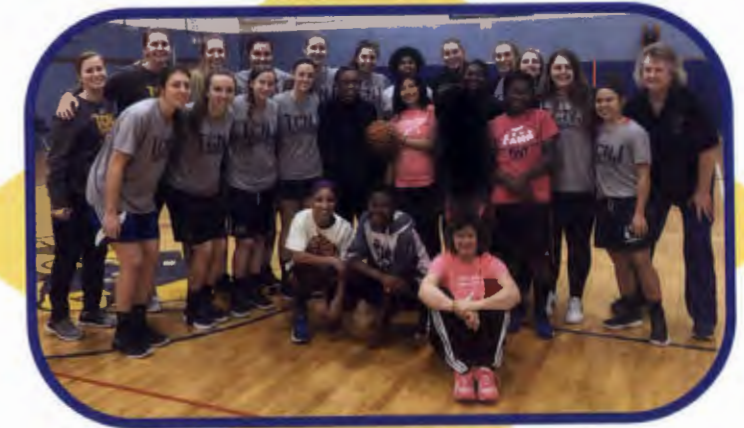
PICTURED: MKSD Girls' and TCNJ Women's Basketball teams practice together at MKSD High School