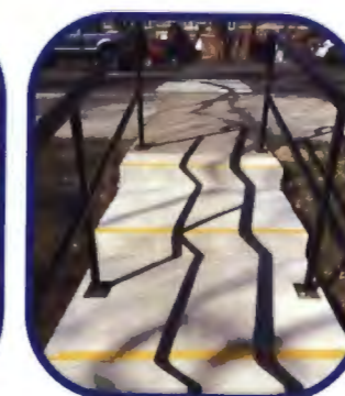
Steps outside of ECP now have yellow stripes