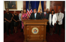
July 30, 2014 Bail Reform