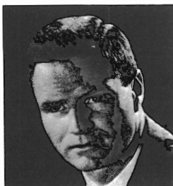
BRENDAN T. BYRNE, president, is a lawyer, former state deputy attorney general, Essex county prosecutor, governor's secretary.