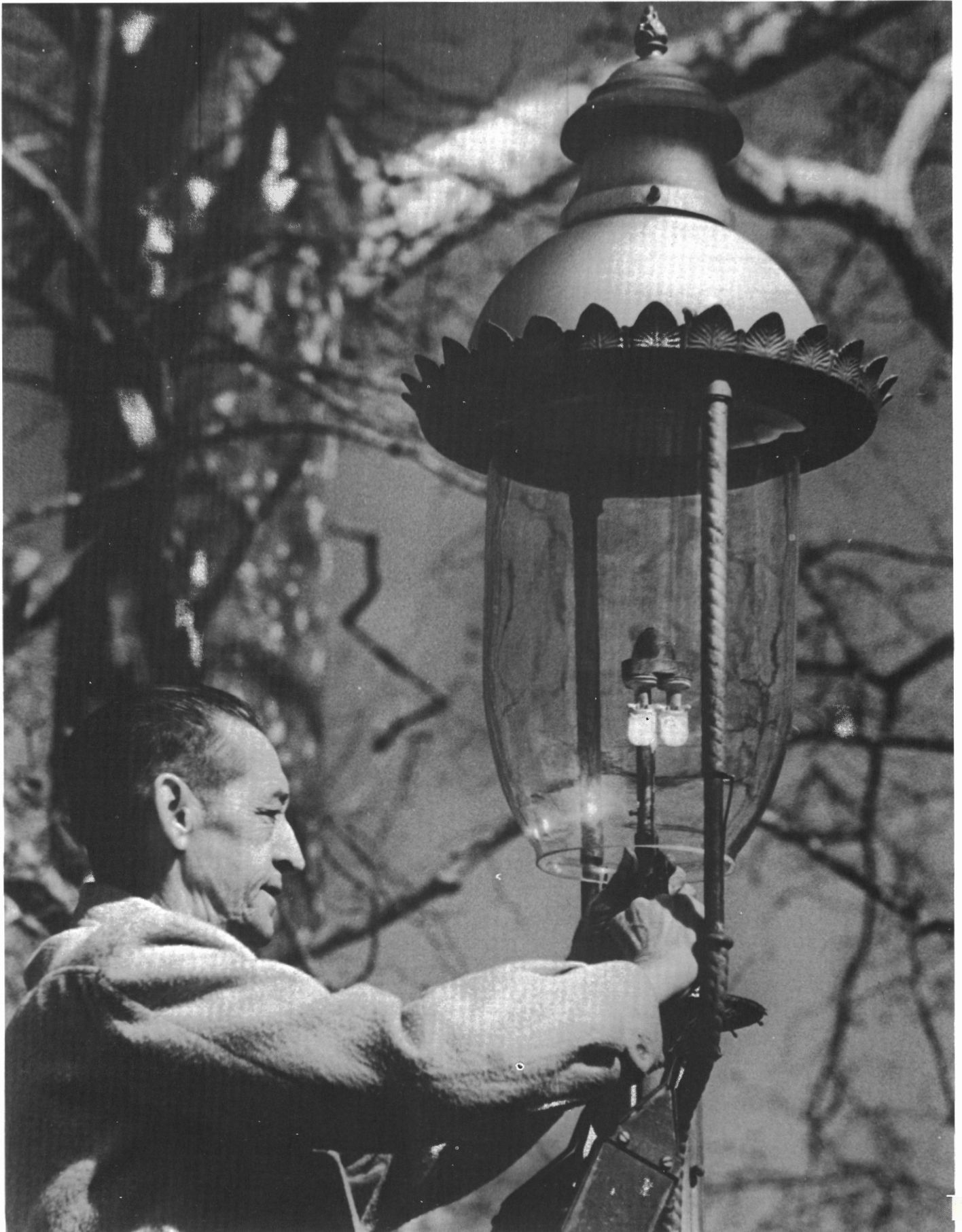
A Touch of Nostalgia... Even in this atomic era there are still traces of a more leisurely age in New Jersey. Here one of the relatively few remaining street gas lights in the state is adjusted by a utility employee.