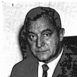
WILLIAM E. OZZARD, commissioner, is a former assistant county prosecutor, assembly man, state senator from Somerset county, senate president and majority leader.