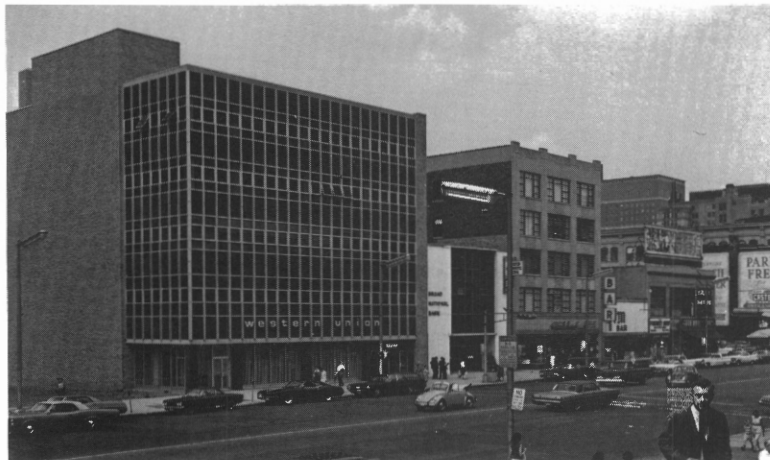
Modern Look... Telegraph offices have adopted modern look

Encouraged utility expansions to meet growing needs of state.