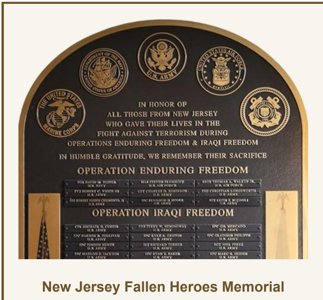
New Jersey Fallen Heroes Memorial