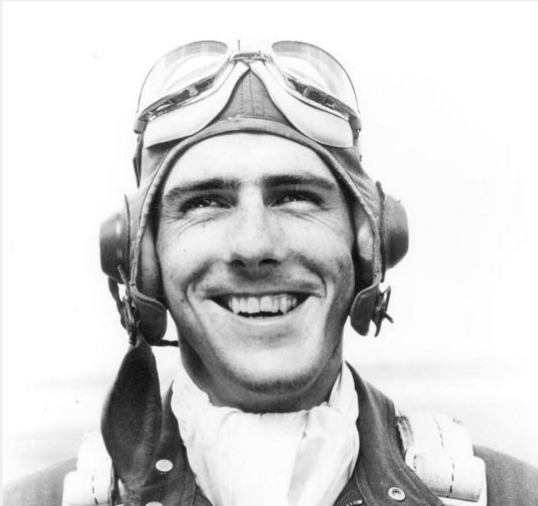
Maj. Thomas B. McGuire Jr.