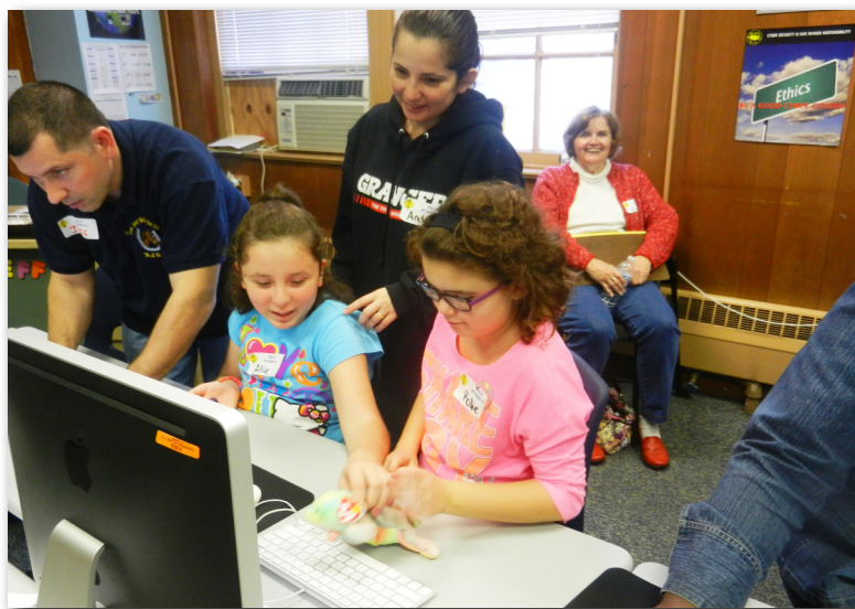
ELMS students and parents enjoy the computer activity during Family Fun Day!

On Saturday, November 15, 2014 the first “Family Fun Day” was held from 1-4 pm here at MKSD. There were over 80 people in attendance at this fun event. The idea was to have fun interaction with our families, friends and staff using American Sign Language. There were various activities set up and family groups assigned to each activity. Every 20 minutes the groups changed activities. Families participated in Bingo, ASL Music videos, ASL Ebook stories, Computer/IPAD room, and various ASL games. There were prizes and refresh-