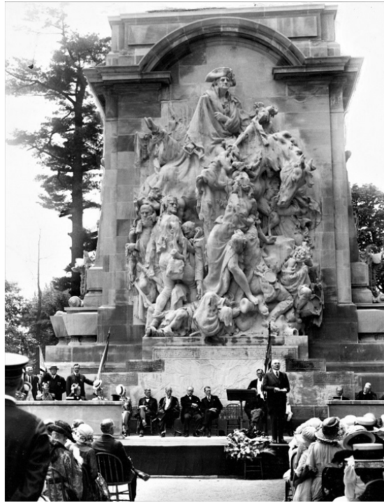
Princeton Battle Monument Dedication in 1922.