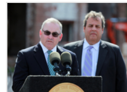
Revitalizing Trenton Wednesday, September 7, 2016