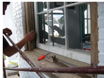
Phoenix Hall, Mendham, Morris County