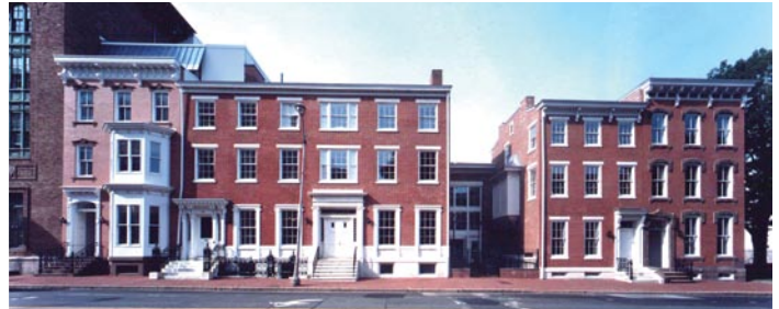
Exterior View of Townhouses after renovation and addition, DF Gibson Architects, PC Architect of Record

lighting, and creating large community spaces that were easily accessible, the project design and construction incorporated the basic principles of sustainable design on time, within the budget, and to the great satisfaction and pleasure of the owner and end users. This facility has won two awards since opening in June of 2000, including the NJ Downtown Redevelopment Grand Prize and the American School & University Award for Design Excellence, proving that preservation, adaptive reuse, and sustainability are a natural fit.