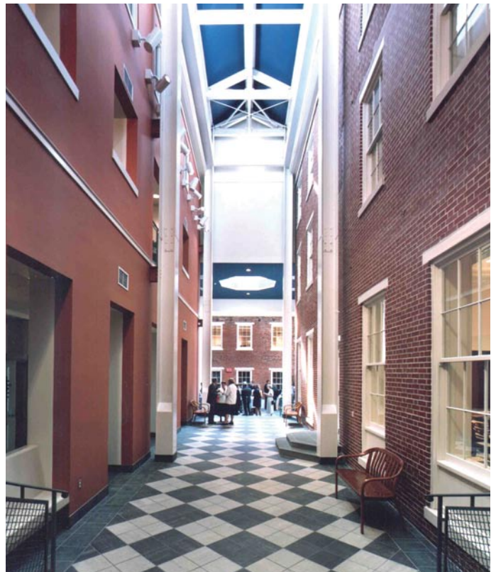
Great Hall connecting existing townhouses and addition, DF Gibson Architects, PC, Architect of Record