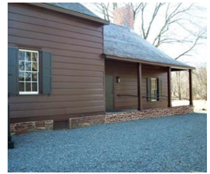
Reconstructed Kitchen Wing

the 1778-79 Pluckemin encampment, was restored to its 18 th century appearance. The reconstructed kitchen wing, however, is designed for contemporary needs. It is handicapped accessible, and houses exhibits, comfort facilities, administrative offices and program space. The Friends selected a Geo-thermal heating system that is efficient, quiet has low CO2 emissions and environmentally sensitive. This project was supported in part by a grant from the New Jersey Cultural Trust.