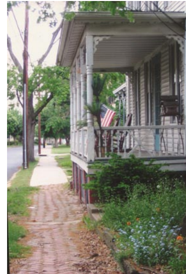
Stockton Street District, Hightstown, Middlesex County