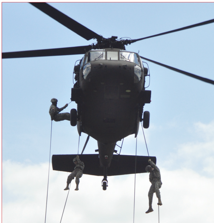
The 1-150th Helicopter Assault Battalion assists West Point cadets rappel from a Black Hawk June 14, at the Military Academy. Three Black Hawks provided the aerial support as cadets in groups of four rappelled from more than 80 feet in the air on to the practice field at West Point Military Academy. To view more photos of the 1-150th annual training, please visit the New Jersey National Guard's Facebook page by following this link: New Jersey National Guard .